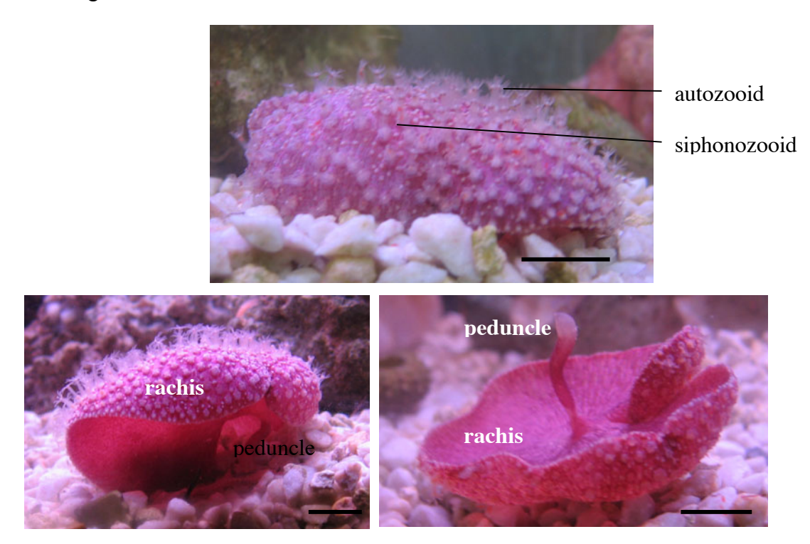
Figure 1. Anatomy of Renilla muelleri . Scale bars are approximately 1 cm in length.

The sea pansy ( Renilla spp. ) is a soft coral, a cnidarian of the class Anthozoa. These animals live on the ocean floor in shallow waters, and can often be found on the beaches of the southeast United States at low tide. Renilla polyps have various forms, including the tentacled feeding polyps, called autozooids, and the polyps that regulate water circulation, called siphonozooids (Figure 1). These polyps share an umbrella-shaped colonial structure, the rachis, and a foot-like structure, the peduncle (Figure 1). Both the rachis and the peduncle contain a water vascular system, muscular tissue, and nervous tissue, and the coordinated movements of these structures allow Renilla to anchor into the sand and move along the sea floor