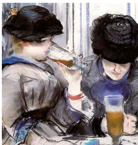
On the cover: Graphic elaboration of Women Drinking Beer (1878) by Édouard Manet; The Burrell Collection, Glasgow.