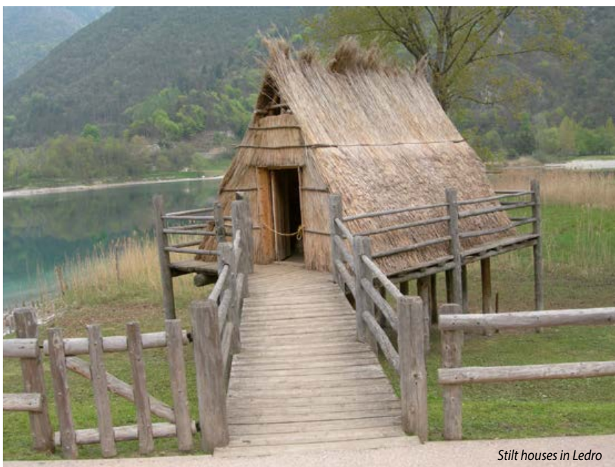
Stilt houses in Ledro