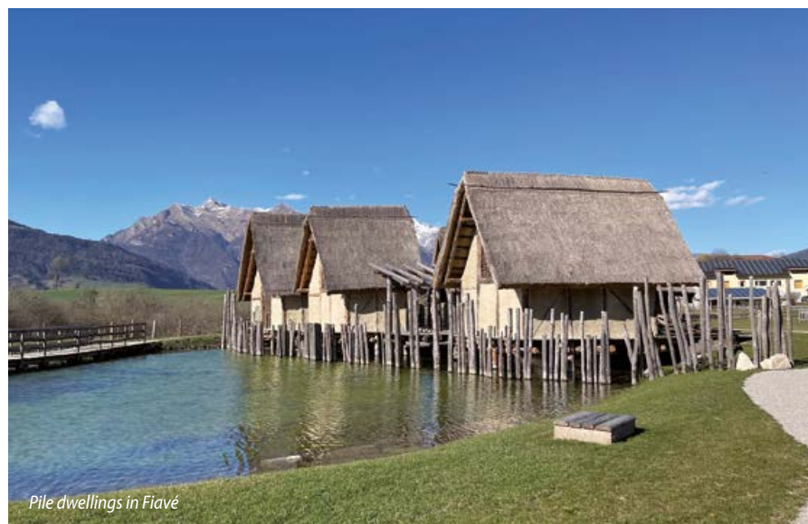
Pile dwellings in Fiavé

Making a historically important product commercially viable