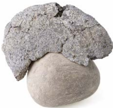
The Bronze-Age loaf.

In these mountains, the baker's art has flourished since prehistory.