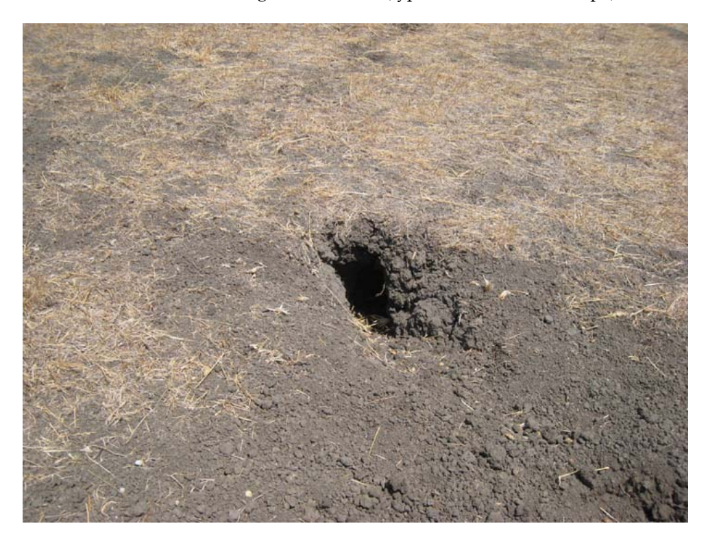
Photo 7: Mammal burrow, higher than wide (typical of kit fox den shape)