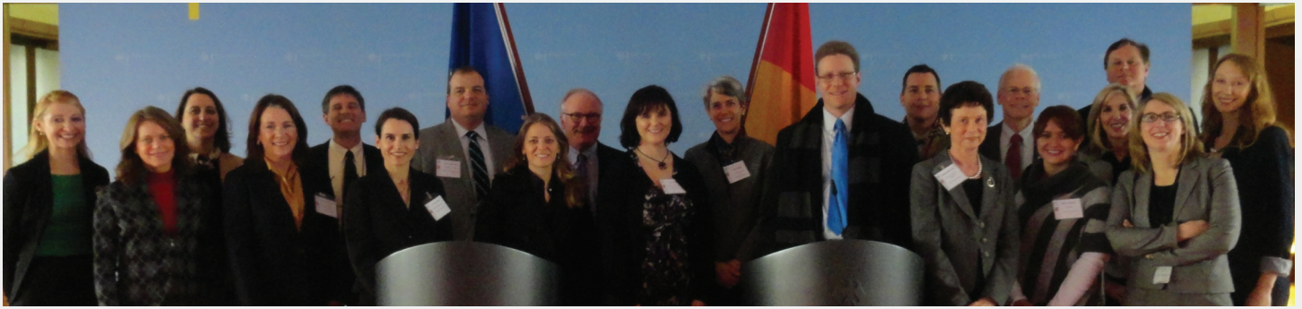
December 2012 Study Tour participants visiting the German Foreign Office

The ACG organized two Study Tours to Berlin in 2012 to convene American and German experts and establish detailed dialogue on immigration and energy issues, respectively. Each Study Tour is designed as a two-way exchange of ideas to examine best practices and insights on the political landscape in Germany and the United States. These programs are generously funded by the German Federal Ministry of Economics and Technology's European Recovery Program to support transatlantic dialogue.