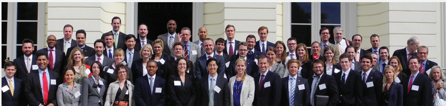
The 2012 American-German Young Leaders at Schloss Bellevue

The American Council on Germany's American-German Young Leaders Conferences bring together 50 stellar American and German young professionals each year to discuss key political, economic, and social issues on the transatlantic agenda and to promote networking among future leaders. The conferences build understanding, new perspectives, and ultimately strong bonds among the delegation. Delegates to the 34th conference met from July 13 to 19, 2012, and asked, "Is the Transatlantic Relationship Relevant to Meeting Today's Challenges?" – and came back with a resounding yes.