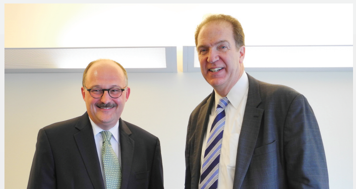
Speaker Michael Meister , Deputy Chairman of the CDU/CSU Parliamentary Group of the German Bundestag, and David R. Malpass , President of Encima Global LLC (left to right)