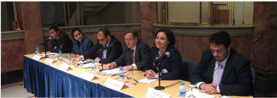
Panelists at the Multilateral Young Leaders Conference

The Multilateral Young Leaders Conference – titled “Mediterranean Bridges” – took place on May 12 and 13, 2012, at the Istanbul Policy Center at Sabancı University in Turkey. The meeting was held in conjunction with the Atlantik-Brücke and the Council for the United States and Italy. This conference sought to develop a network and dialogue among future leaders from the Mediterranean as well as across the Atlantic. Delegates from Germany, Italy, North Africa, Turkey, and the United States took part in the conference, including academics, bankers, environmentalists, journalists, and leaders from the public and private sectors. Lively discussions were rooted in the unique background and interests of the participants. The conference agenda addressed topics relevant not only for the Mediterranean region but also for wider international relations.