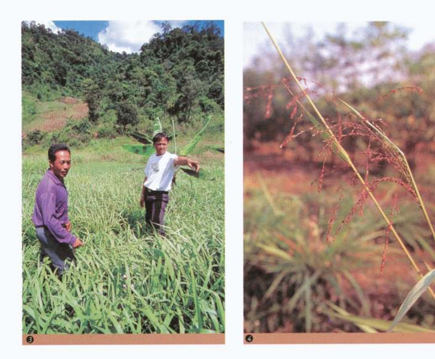
'Si Muang' has purple stems (JH) It is a tall, upright grass (LS) 'Si Muang' used for cut and carry in northern Laos (JH) It produces good seed throughout Southeast Asia (JH)

Another promising variety, 'Tobiata', is taller and has broader leaves than 'Si Muang'. 'Tobiata' has hard hairs on the base of stems which can irritate skin during cutting.