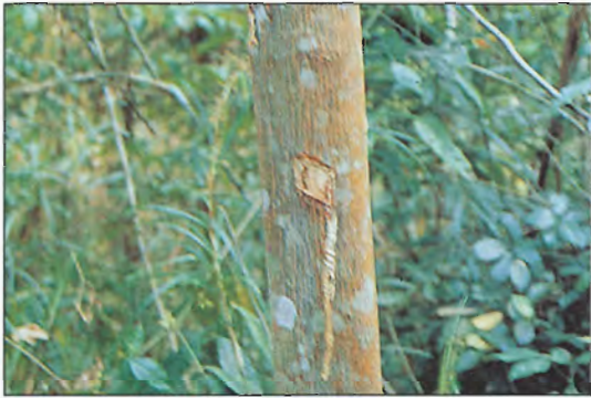
Plate 2. Resin flows from incision on a tree of Styrax tonkinensis