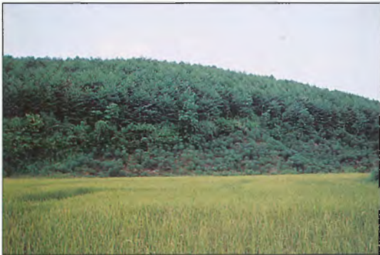
Plate 4. Two-year-old plantation of Styrax tonkinensis at Cau Hai, Vinh Phu, Vietnam