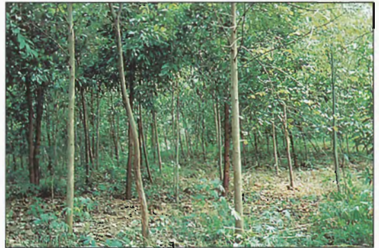
Plate 5. Styrax tonkinensis interplanted with Acacia mangium at Cau Hai, Vinh Phu, Vietnam. Growth of the two species is comparable at three years of age