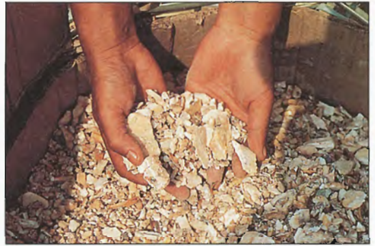
Plate 3. Benzoin resin of Styrax tonkinensis