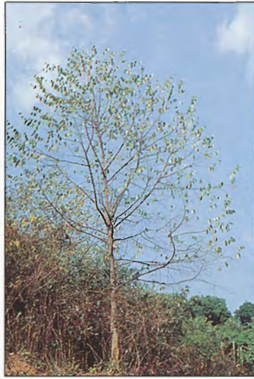
Plate 1. A five-year-old tree of Styrax tonkinensis at Ban Kajet, Louang Phabang, Laos