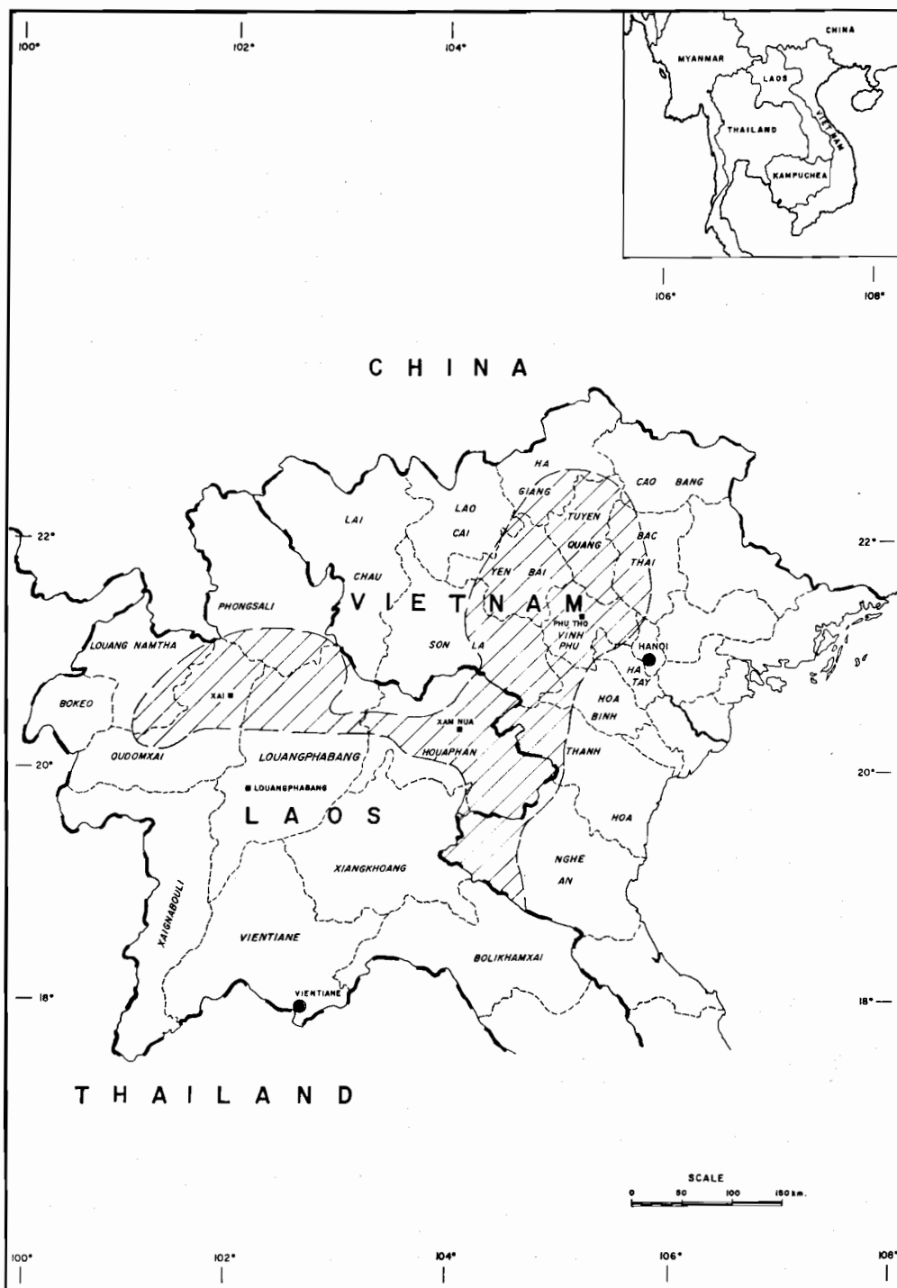
Figure 2. Natural distribution of Styrax tonkinensis in Laos and Vietnam.