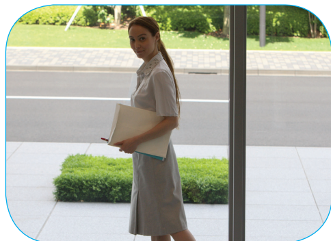
Smart Shade Control