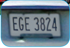
40x (maximum) zoom