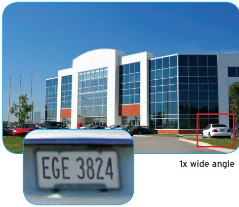
1x wide angle