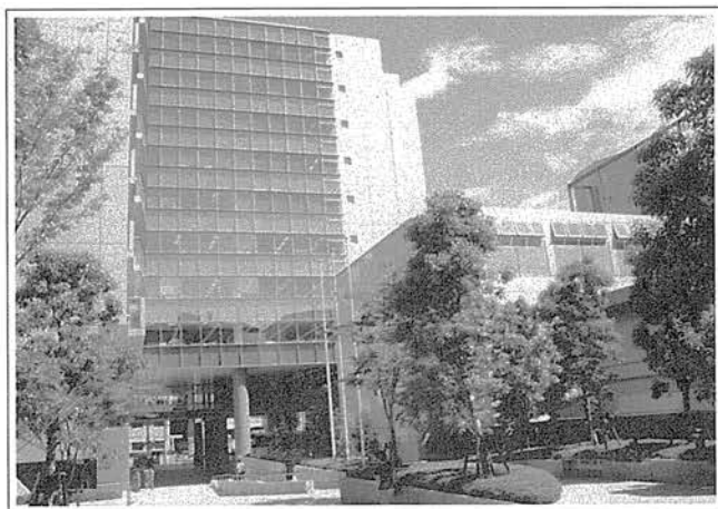
The Asahi Glass Foundation's home is in Tokyo's Science Plaza Building.

The Foundation strives to contribute to the creation of a richer, more vibrant society. To this end, it supports research in leading-edge scientific and technological fields and recognizes individual and organizational efforts to solve issues of concern to people around the world.