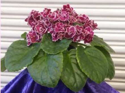
Candyman—judged as Best in Show