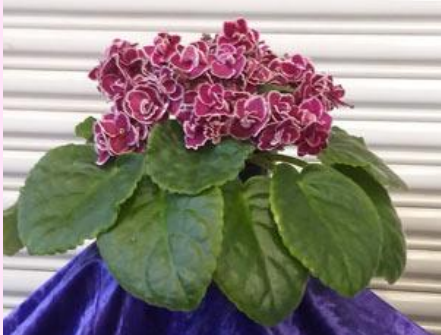
Candyman—judged as Best in Show