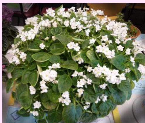
Jays' Icecastle—Best Trailing African Violet and a host of other awards.

I hope you will excuse the brevity of this issue. Personal matters have again intervened. I have plenty more to say—of course—but next time!