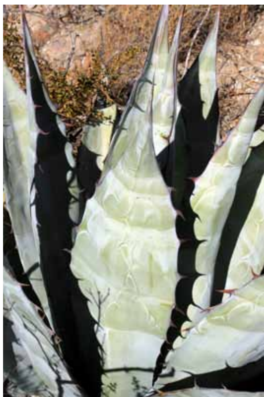
Figure 4A. Leaves of Agave azurea .

Solitary, acaulescent rosettes of 13–32 leaves, 80–90 cm tall by 100–153 cm across, monocarpic (Fig. 2). Leaves obovate to oblanceolate, glaucous blue-green, plane to slightly guttered, 55–76 cm