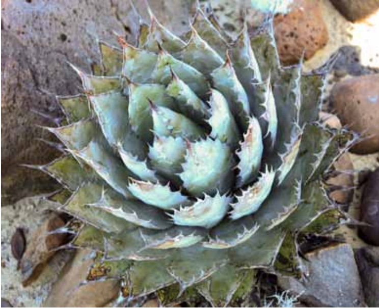
Figure 9. Agave vizcainoensis from Cerro Prieto, Vizcaino Peninsula. These plants were misidentified as Agave sebastiana in herbarium specimens, probably because of the large number of leaves. However, the undulate margins, abundant leaf impressions, and particularly the short, narrow inflorescence (not shown) indicate that it either belongs to A. vizcainoensis or is a new subspecies.

cattle, horses, and goats and appears to be light. The climate is partially moderated by fog, particularly around the higher peaks of the Picachos de Santa Clara. Precipitation is highly variable in amounts and seasonality, owing to prolonged winter droughts, unpredictable summer rainfall, and the potential for incursions of tropical cyclones that can drop substantial rainfall on these mountain ranges. Future climate change is unlikely to change this high variability or affect this species unless the incidence of fog is reduced. The low production of viable seeds, however, could suggest a problem with pollinators. More research would be needed to determine what pollinators visit these plants and whether they might be threatened.