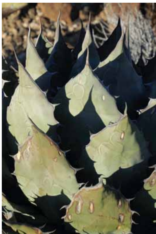
Figure 4B. Leaves of Agave vizcainoensis .