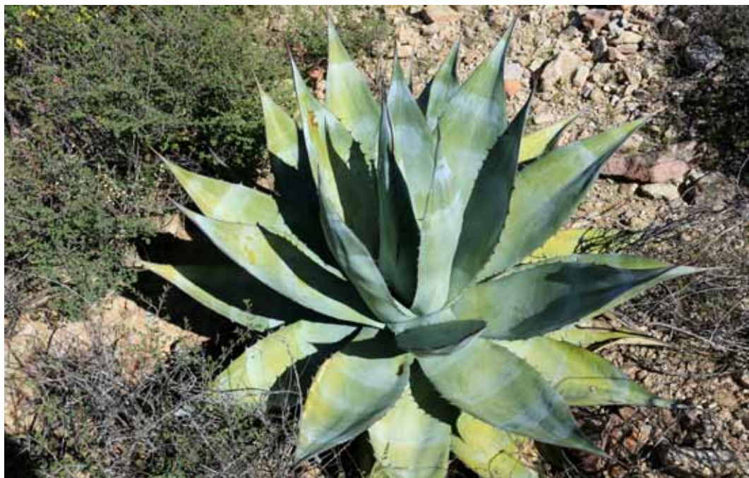
Figure 3. Agave azurea in the Picachos de Santa Clara.

Similar to Agave vizcainoensis but differs by the solitary habit, larger rosettes with more glaucous blue-green leaves, leaf shape, larger flower size, and filament insertion.