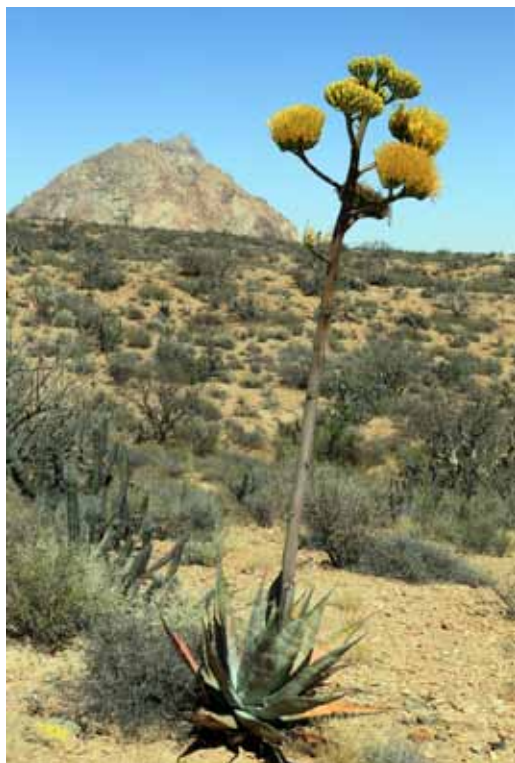
Figure 5A. Flowering individual of Agave azurea . Pico de Gato appears in the background.