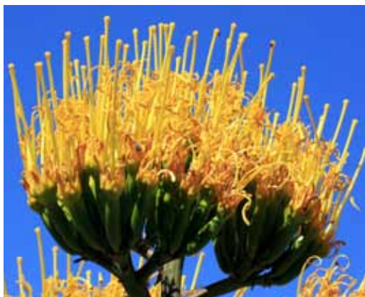
Figure 5B. Flower umbel of Agave azurea .