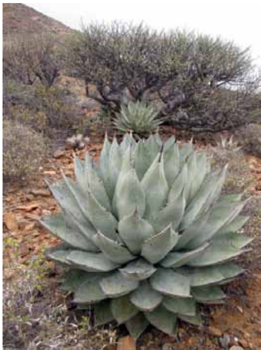
Figure 10. Agave sebastiana on Isla Cedros in front of Pachycormus discolor ssp. veatchiana .

several localities on the island. The plants were solitary to offsetting and formed large colonies; had numerous, glaucous gray leaves (Fig. 10) with relatively straight margins and numerous teeth; had a short, acute tip below the stout terminal spine, which was decurrent to the fifth or sixth pair of teeth; and had relatively short, wide inflorescences as befitting the Umbelliflorae. These plants agree with the published descriptions of A. sebastiana (restated in Gentry 1978, 1982) and are easily distinguished from plants found on the mainland. Gentry (1978, 1982) discussed the relationship of A. sebastiana to A. shawii based on floral morphology in the Umbelliflorae, whereas plants on the peninsula are either in the Deserticolae or transitional between the two groups (like A. azurea ).