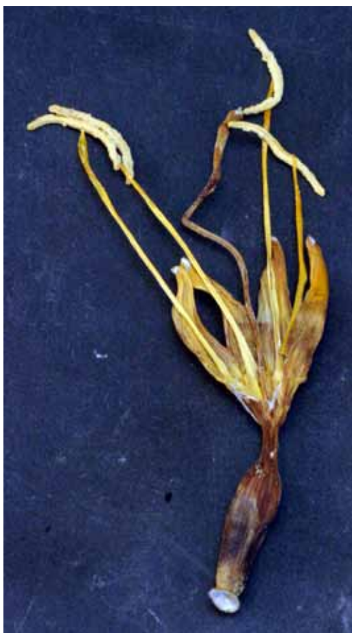
Figure 5C. Dry, sectioned flower of Agave azurea . The bent, brown structure in the center is the style.