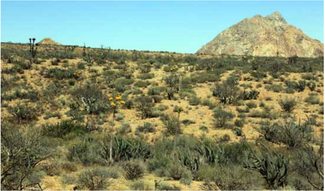
Figure 6. Northeast slope of Mesa La Distiladera looking towards Mesa Cirio showing many inflorescences of Agave azurea and its habitat.