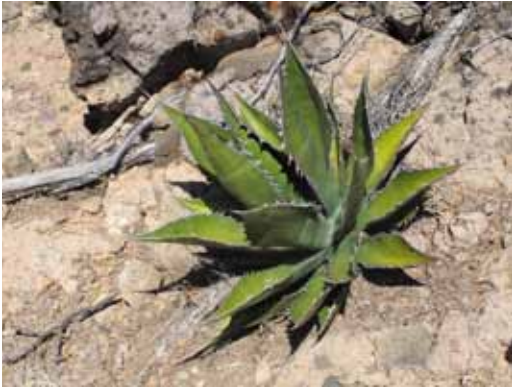
Figure 7. The distinctive green Agave gigantea in the northern Sierra de la Giganta.

the Vizcaíno Peninsula or its off-shore islands. Agave azurea does not offset, is larger than A. vizcainoensis in most characters, its leaves are significantly different in shape and margins (Fig. 5A), and its capsules and seeds are smaller. It is evident that Agave azurea and A. vizcainoensis are closely related, but what is not clear, is the relationship of those two to other species on the peninsula. Gentry (1978, 1982) stated that, because of the deep flower tube, A. vizcainoensis does not show a close relation with other members of the Deserticolae, but he included it in that group for lack of a better option.