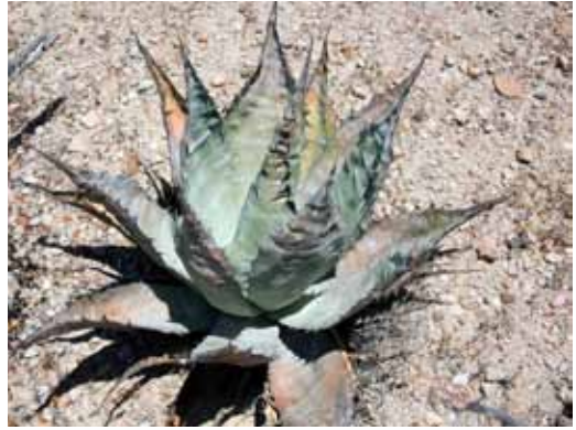
Figure 8. Agave vizcainoensis from near Cerro La Minita, Vizcaino Peninsula.

Temperature and rainfall on the Vizcaíno Peninsula are poorly known but are highly variable and influenced by seasonal fog and tropical cy-