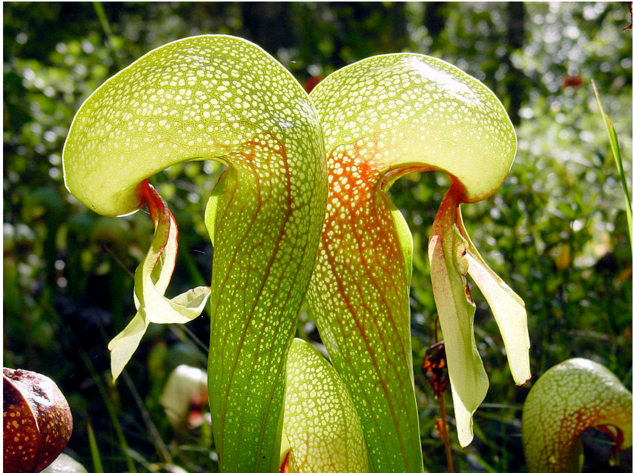
Darlingtonia californica

For many years I have tried to start Darlingtonia californica from seed. I thought that it was a really attractive plant for those mucky parts of the garden. I must have ordered it almost every time it showed up in the seedlists but never had any luck. Even when I put the whole pot in a saucer of water (a method that often works for plants that like marshy conditions) there wasn't any germination. Eventually I hit on a solution because of another plant. One Fall we collected seed of Oenothera (now Camissonia ) tanacetifolia in SE Oregon on the edge of the Thompson reservoir. Although I sowed my own fresh seed that same Fall, nothing came up the next Spring. I was highly puzzled because I was convinced it was good seed. Eventually I thought and visualized that in the Spring, when the reservoir was full, the place where it grew might well be underwater. So, I dunked the whole pot in a container with a couple of centimeters of water above the surface of the soil. And indeed, after some time I got seedlings, which obviously were Camissonia . I reasoned that if it worked for one species that it might work for another. So the next