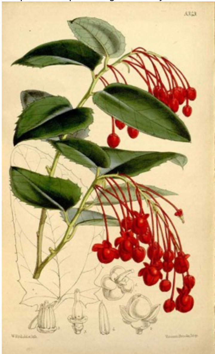
Berberidopsis corallina in Curtis Botanical Mag 1862 Walter Fitch

Berberidopsis corallina (Flacourtiaceae) is a beautiful evergreen climber from southern Chile. It is now considered extinct in the wild. Here it reaches 4 to 5m against a shady, east-facing wall. The red flowers dangle in clusters at the ends of the branches in late summer. It is considered to be tender but so far has survived for us in this protected spot for eight or nine years.