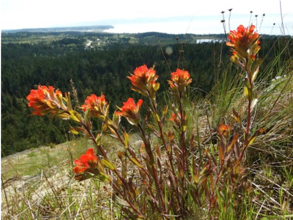
Castilleja hispida with Olympic Peninsula faintly outlined in the background

Alpine flower hiking in the British Columbia Coast Mountains and Cascades is limited to the summer months. The snow does not melt in the high meadows until July and even August at some locations. Good places for a day hike in the summer include Manning Park in BC and the Mt. Baker area in Washington State. However wildflowers can be seen in April in the southern Gulf Islands and adjacent areas with similar climate and habitat. The southeast fringe of Vancouver Island, parts of coastal Washington State and several of the southern Gulf Islands are called the Garry Oak Ecosystem reflecting the unique climate and geology. (Ed: See map of this area from the beginning of the core reference material here: http://www.geog.ubc.ca/biodiversity/GarryOakEcosystems.html )