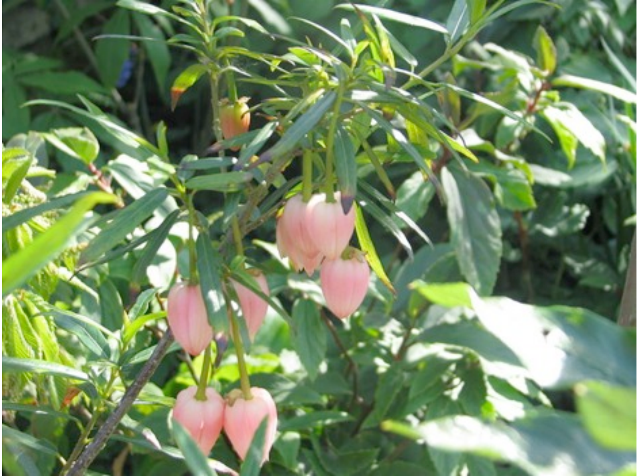
Crinodendron 'Ada Hoffman'