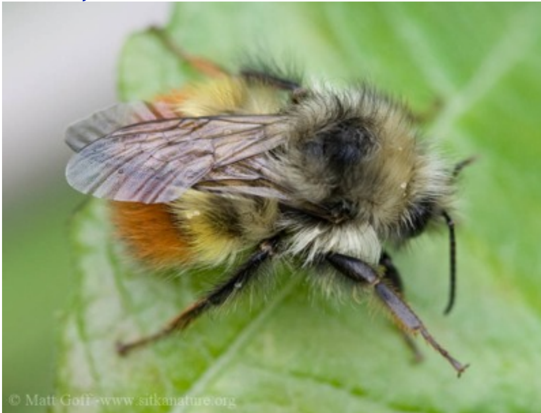
Bombus flavifrons , the bright yellow bumble bee Matt Goff Sitka Nature.Org

As gardeners, we must all try to participate in turning around this horrific situation. There are ways that we can encourage bees into our gardens to improve the likelihood of their survival. In most cases, doing nothing as far as "changing" our environment is the best thing that a gardener or property owner can do. Bees will seek out spots that provide them with the necessities of life and reproduction- water, food, shelter and mates. The most important bees are the Bombus species or bumble bees. Here is a link to their excellent local guide to bumblebees- http://beefriendly.ca/bumble-bees/