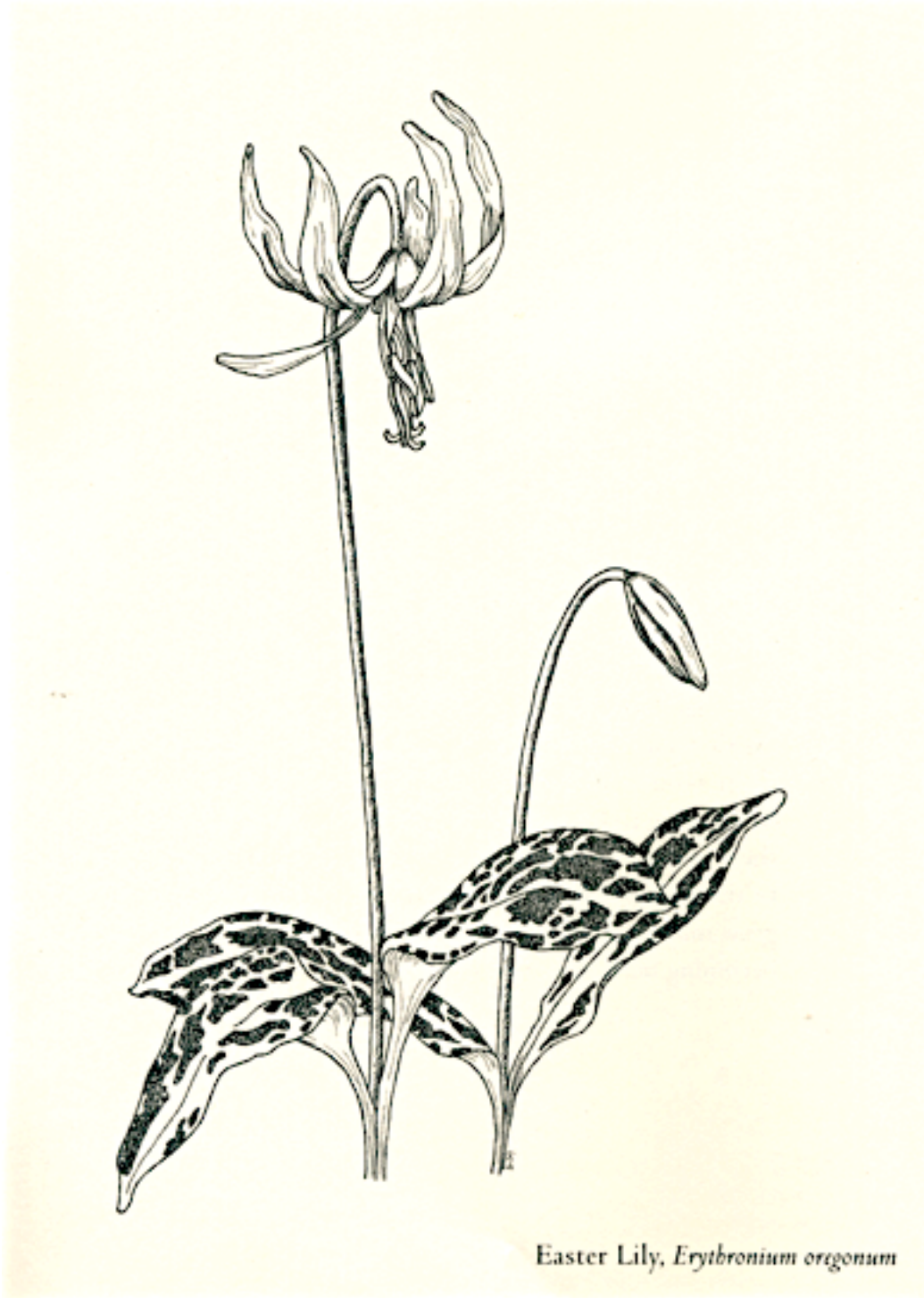
Easter Lily, Erythronium oregonum