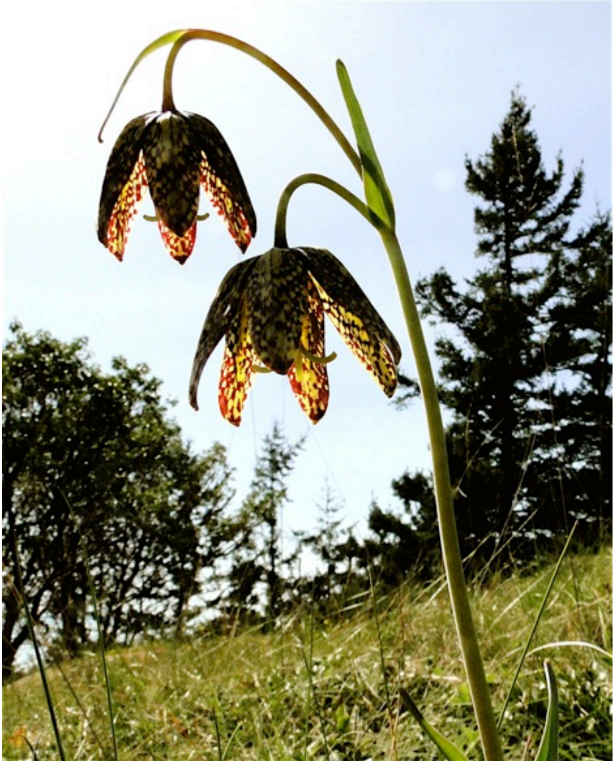
Fritillaria affinis , a striking maroon/ yellow form