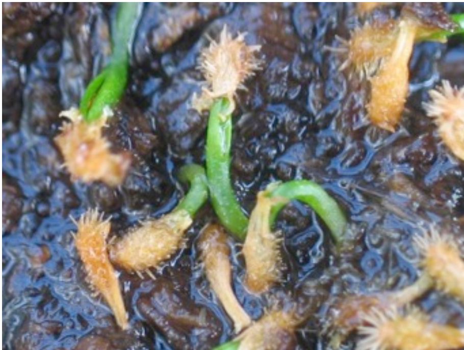
Seedlings of Darlingtonia californica

Wikipedia has a good entry: http://en.wikipedia.org/wiki/Darlingtonia_californica