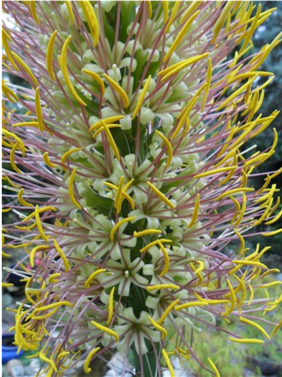
Agave filifolia in flower