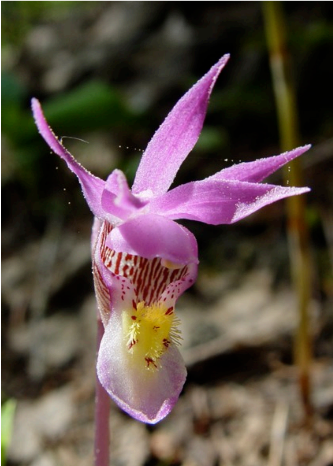
Calypso bulbosa close-up 33