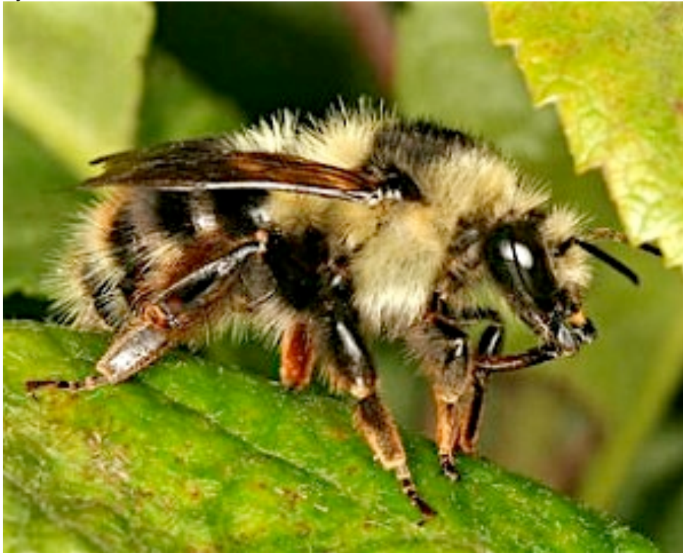
Bombus mixtus , the orange-tailed bumble bee

There's a buzz around but unfortunately, it isn't from bees.