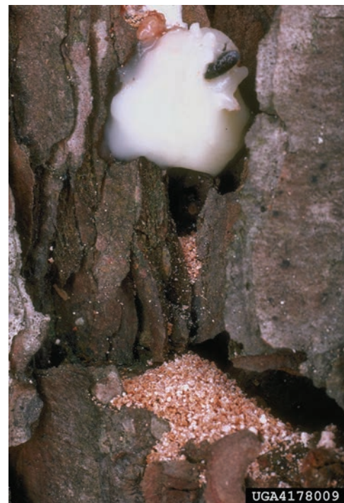
Figure 6. Frass or fine dust in bark crevices.

air temperature reaches or exceeds 58°F (Moser and Dell 1979). All life stages of the SPB can overwinter and continue activity when the temperature warms in the spring. Trees attacked by SPB usually show fading of the entire crown. The visual symptoms of tree death start with the crown fading to yellow and then quickly to red, especially during hot weather. The red needles fall from the tree soon after changing color. Once the needles drop, the SPB have left the tree. Trees that still have yellow and red needles may still have SPB larvae and pupa under the bark. Close examination of an infested tree will show fine wood dust around the base of the tree, in bark crevices, and on spider webs and other plants adjacent to the infested tree (Figure 6). This dust is a result of