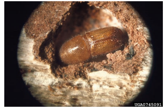
Figure 1. An adult bark beetle in a pine stem.