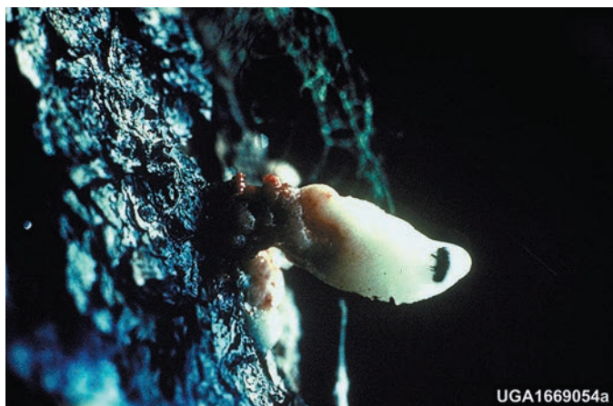
Figure 7. A pine bark beetle trapped in crystallized pine resin.

Pine trees have a natural mechanism to protect themselves from bark beetle attacks. They produce pitch, a sticky substance, which floods beetle galleries and drives the beetles out or encases them in crystallized resin (Figure 7). Often the pitch leaks out of the holes bored by beetles entering the tree and hardens into white or cream-colored globs called pitch tubes (Figure 8) that can look like popcorn kernels on the bole of the tree. Trees which are not stressed can oftentimes produce enough pitch flow to prevent successful bark beetle attacks. However, trees stressed by overcrowding or drought may produce little or no pitch, enabling a successful bark beetle attack.