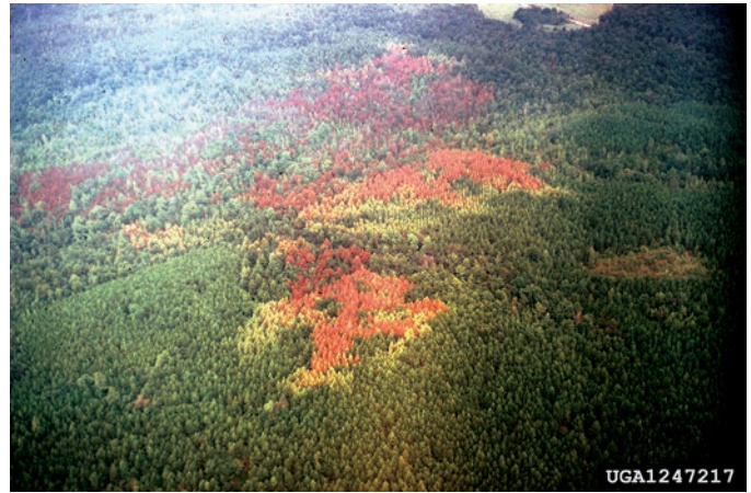
Figure 5. A "beetle spot" surrounded by a zone of yellowing trees that have been more recently infested.

Initial SPB attacks occur in the spring often on trees that have been damaged by lightning or harvesting machinery. If the trees in the stand are stressed from overcrowding or drought, the insects are more likely to successfully attack the tree and spread to adjacent trees. This cycle produces a group of infested trees called a beetle spot (Figure 5) which, under the right conditions, will continue expanding throughout the growing season. Beetles actively fly when