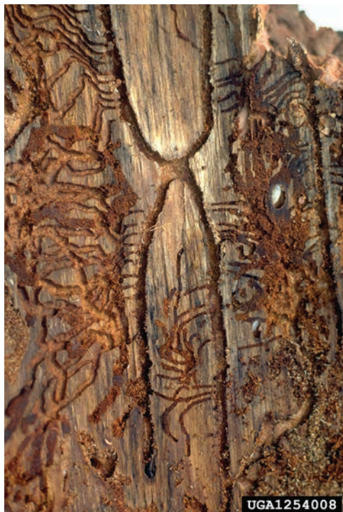
Figure 11. Ips beetles create galleries that are either “H” or “Y” shaped.

Artwork courtesy of Southern Forest Insect Work Conference, Bugwood.org