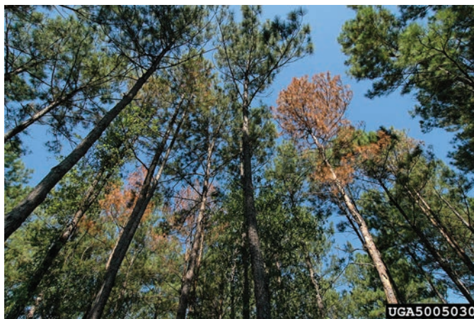
Figure 18. Ips often kill scattered trees or scattered branches within a tree.

Because Ips beetles seldom create large spots of dead trees, the treatment for these attacks is different than that of SPB. Usually Ips infestations occur on single trees or small groups of trees scattered throughout a pine stand (Figure 18). This makes the use of buffers around infected trees unnecessary in most instances. If enough trees are infested within a stand, then a salvage of infested trees can be economically viable. However, if there is extreme drought or some other severe stressors predisposing the trees to attack, then logging damage to residual trees can cause the Ips beetle infestation to spread. These salvage operations should be conducted in the late fall or winter when the insects are not active. During the late fall and winter, reduced sap flow in pines makes trees damaged during the harvesting operation less attractive to Ips beetles. Because the two smaller Ips beetles infest the tops and limbs, care should be taken during salvage operations to make sure tops and limbs that remain are not left next to healthy trees. Leaving them next to healthy trees can give the Ips beetles an opportunity to move from the infected top into the adjacent healthy trees.