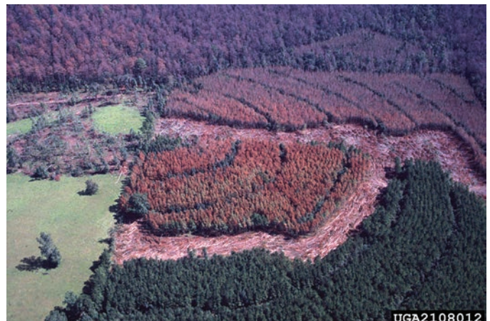
Figure 17. Spread of this beetle spot has been halted by the buffer strip. Salvage logging will begin soon.

the last infested tree must be cut. For example, if the infested trees are 50 feet tall, then the buffer strip must extend at least 50 feet past the last infested tree. Third, the uninfested buffer trees must be harvested immediately by the salvage logging crew (Figure 17). All trees in the buffer must be felled back toward the center of the SPB spot or dragged back to the center after felling to assure that any remaining infested trees will not introduce SPB into the uninfested region beyond the buffer strip. After felling the buffer strip, the logger should cut the remaining trees