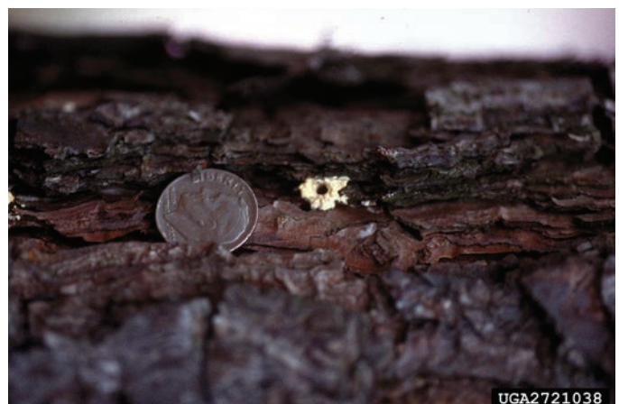
Figure 12. A pitch tube created by an Ips beetle.

Since some of the Ips beetles attack the crown of the pine tree, many times the needles on only one or a few limbs may fade to yellow and then to red, indicating an insect attack. However, like the SPB, if the larger Ips beetles attack the lower bole of the tree, then the entire crown may fade at the same time.