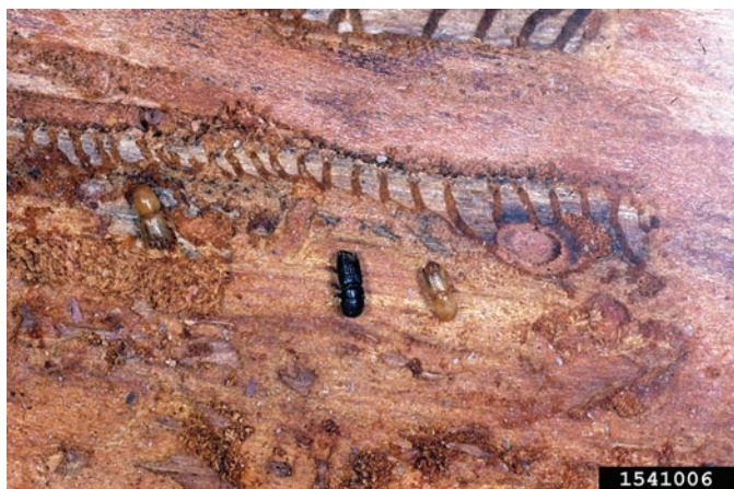
Figure 9. An adult Ips engraver beetle.

There are three species of Ips bark beetles native to Arkansas (Figure 9). They are (1) the six-spined engraver ( Ips calligraphus Germar), (2) the five-spined engraver ( Ips grandicollis Eichhoff) and (3) the four-spined engraver ( Ips avulsus Eichhoff). They range in size from 1/8 inch for the small southern pine engraver to 1/5 inch for the six-spined engraver. The Ips beetles have a row of spines along each side of the posterior, hence the name six-spined, five-spined and four-spined. The three Ips beetles are