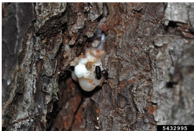
Figure 8. A pitch tube produced in response to a bark beetle attack.