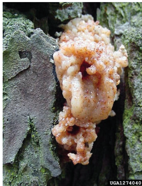
Figure 14. A pitch tube resulting from a black turpentine beetle attack.