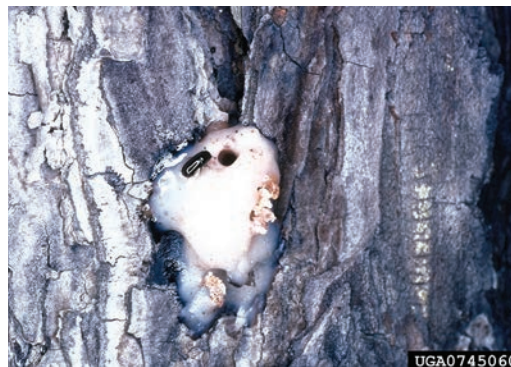
Figure 2. An adult bark beetle stuck in pine resin.

Southern Pine Beetle ( Dendroctonus frontalis Zimmermann) is the most well-known, and the most destructive, of Arkansas' native pine bark beetles (Figure 2). These insects attack pine trees that have been stressed, usually from drought or overcrowding, and can kill the attacked trees in two ways. First, the beetles construct galleries through the inner bark of the tree to lay eggs (Figure 3). After the eggs hatch, the beetle larvae cut galleries through the inner bark as they feed. If enough beetles attack the same tree, the galleries effectively girdle and eventually kill the tree.