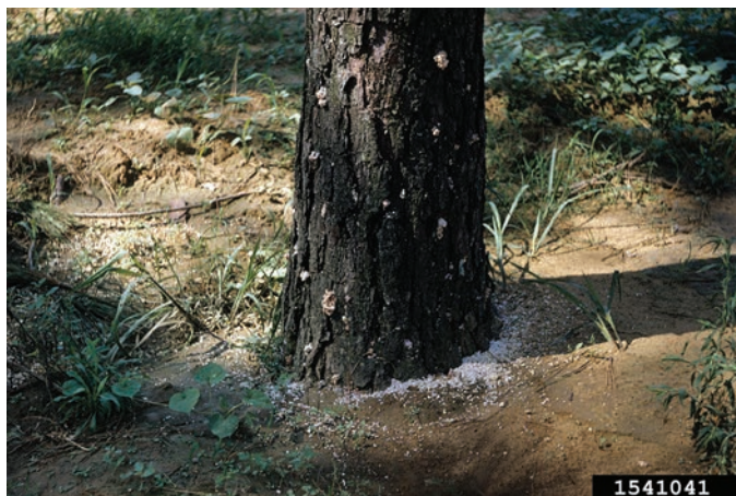
Figure 13. Frass and wood dust created by black turpentine beetles.

Black Turpentine Beetle ( Dendroctonus terebrans (Olivier)) is the largest of the pine bark beetles in Arkansas. They are approximately 1/5 to 3/8 inch long and black in color. Unlike other pine bark beetles, the black turpentine beetle (BTB) attacks scattered trees as a single insect or in very low numbers. They usually attack trees that have been stressed by a lightning strike, previous timber harvest damage, yard work damage, age or some type of environmental factor. Attacks by the BTB can kill trees over a period of months or years, though trees often survive the attacks. The BTB attacks a pine tree and spends a considerable time inside that tree. The beetles kick out frass and wood dust while occupying the tree (Figure 13). This causes the pitch tubes to be reddish or pinkish colored (Figure 14), making them easier to distinguish from the pitch tubes of the other bark beetles. The BTB is typically found in the lower 8 feet of the tree, most commonly in the lower 2 feet. Their feeding and egg laying activities differ from that of the Ips or SPB. BTB produce large round galleries in the inner bark (Figure 15) instead of linear galleries. BTB larvae feed in groups rather than as solitaire larva like Ips larvae and SPB larvae.