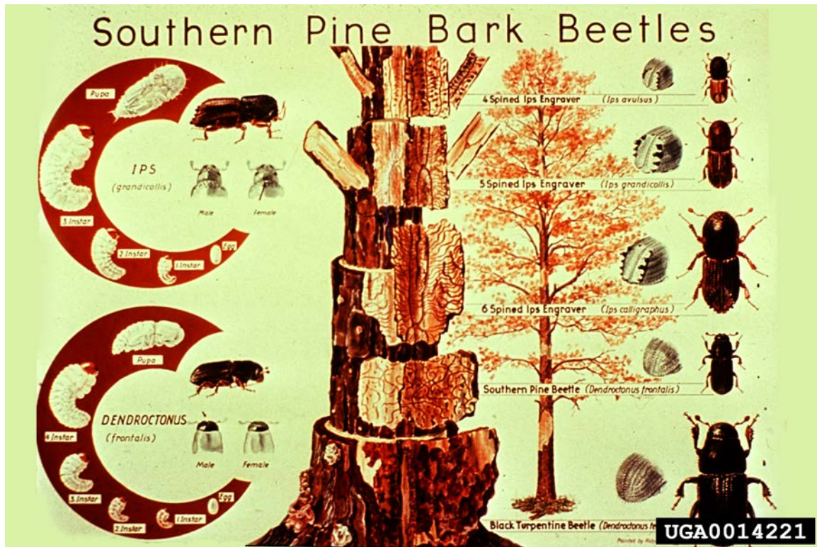
Figure 10. The five species of bark beetles native to Arkansas forests.

Artwork courtesy of Southern Forest Insect Work Conference, Bugwood.org