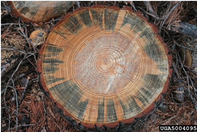
Figure 4. Blue stain fungi can be carried by several bark beetle species.