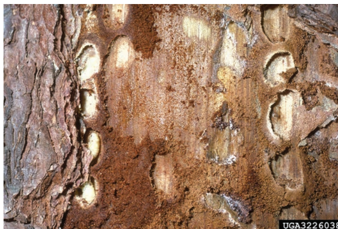
Figure 15. Galleries produced by black turpentine beetles.