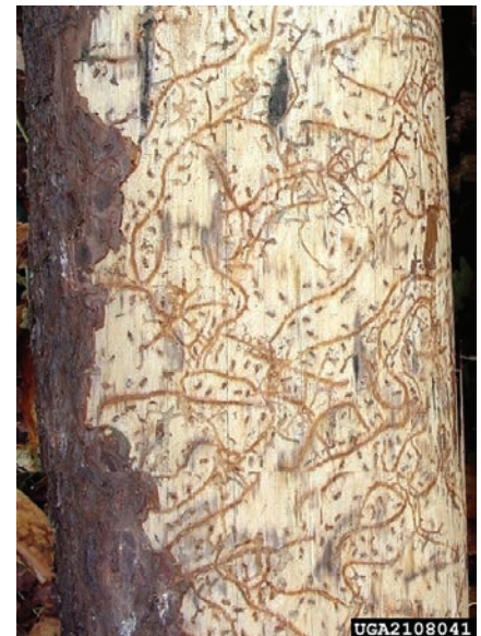
Figure 3. S-shaped galleries constructed by southern pine beetles.

Second, southern pine beetles (SPB) can introduce blue stain fungi (Figure 4) into the trees they attack. Blue stain fungi colonize the xylem (wood) and block the flow of water from the roots to the tree crown, which results in tree mortality. Even if the number of SPB adults and larvae infesting the tree is not sufficient to