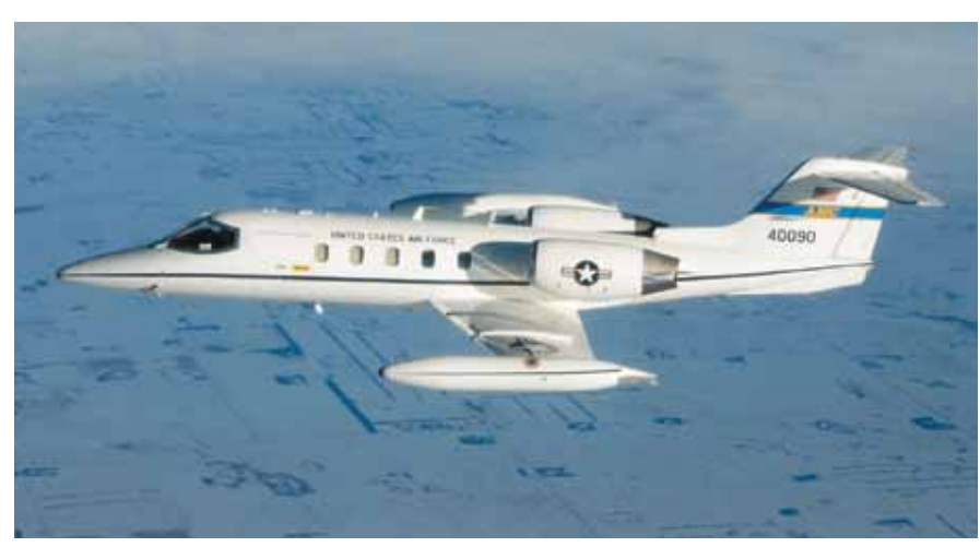
C-21 Learjet

■ C-21A. Military version of the Learjet 35A. Upgrades included color weather radar, TACAN, and