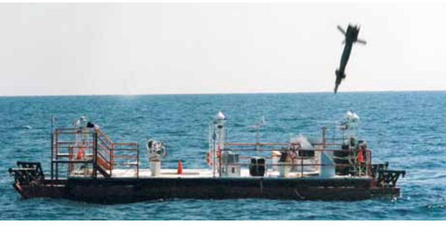
GBU-12 Paveway II (USAF)

Performance: CEP 29.7 ft, range 9.2 miles. COMMENTARY