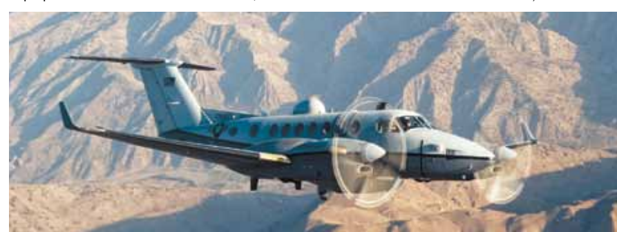
MC-12W Project Liberty

Function: Armed reconnaissance, airborne sur-