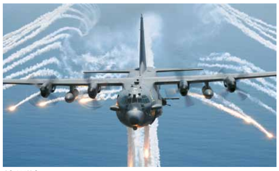
AC-130H Spectre

Multiengine, dual-piloted, self-deployable, mediumlift vertical takeoff and landing (VTOL) tilt-rotor