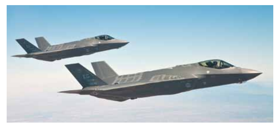
F-35 Lightning II

■ F-35A. First flight by a USAF test pilot on Jan. 30, 2008. F-35A achieved supersonic speed for the first time in November 2008. First weight-optimized F-35A—dubbed AF-1—flew for the first time Nov. 14, 2009. On May 5, 2011, USAF received its first production aircraft—dubbed AF-7—built as part of Lot 1 LRIP F-35 joint schoolhouse at Eglin received its first F-35, a production model F-35ACTOL variant, on July 14, 2011. On Feb. 28, 2012, USAF cleared