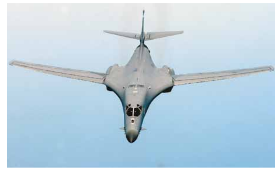
B-1B Lancer

■ B-1B. Vastly upgraded B-1A, with 74,000 lb increase in useable payload, improved radar, and reduction in radar cross section, but max speed cut to Mach 1.2. Total production of 100 B variants, but USAF reduced inventory to 67 aircraft in 2002. One lost in 2008. First used in combat against Iraq during Desert Fox in December 1998. Equipped over the years with GPS, smart weapons