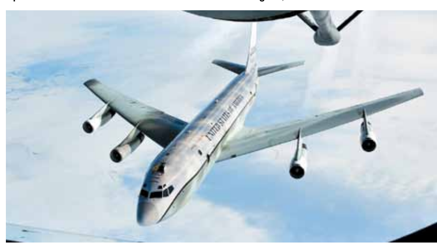
OC-135 Open Skies (A1C Willard E. Grande II)

Weight: max T-O 16,500 lb. Ceiling: 25,000 ft.