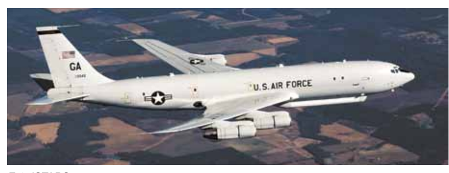
E-8 JSTARS