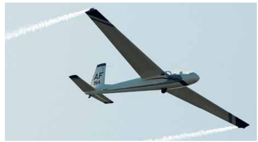
TG-10C Kestrel (Mike Kaplan)

Dimensions: span 55.4 ft (B), 46.6 ft (C); length 27.9 ft (B), 27.6 ft (C); height 6.2 ft (B), 6.9 ft (C).