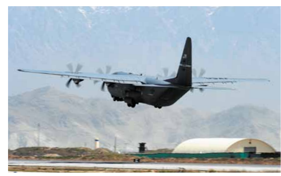
C-130 Hercules

All-purpose theater transport that operates throughout USAF, performing diverse roles. Missions include tactical and intertheater airlift and airdrop support, Arctic resupply, AE flights, aerial spraying, firefighting duties for the US Forest Service, and natural disaster and humanitarian relief missions. FY13 budget decision would terminate the C-130H Avionics Modernization Program (AMP), which would have enabled the model to fly without a navigator, and instead pursue