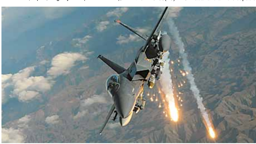
F-15E Strike Eagle

■ F-15E. Has advanced cockpit controls, displays, and a wide-field-of-view HUD. Array of integrated avionics and electronics to permit fight at low, medium, or high altitude, day or night, and in all weather conditions. Carries LANTIRN targeting pods and Sniper and Litening ATPs on dedicated sensor stations. SAR pod provides surveillance and reconnaissance support to ground operations. Potent ground attack capability supplied by GPS-