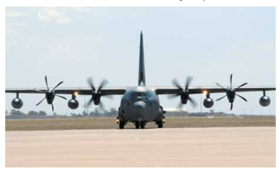
MC-130J Commando II

A C-130H significantly modified to include an EW