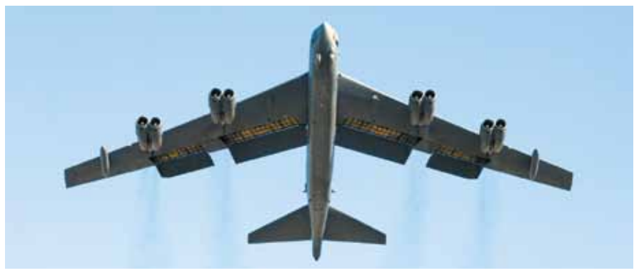
B-52H Stratofortress