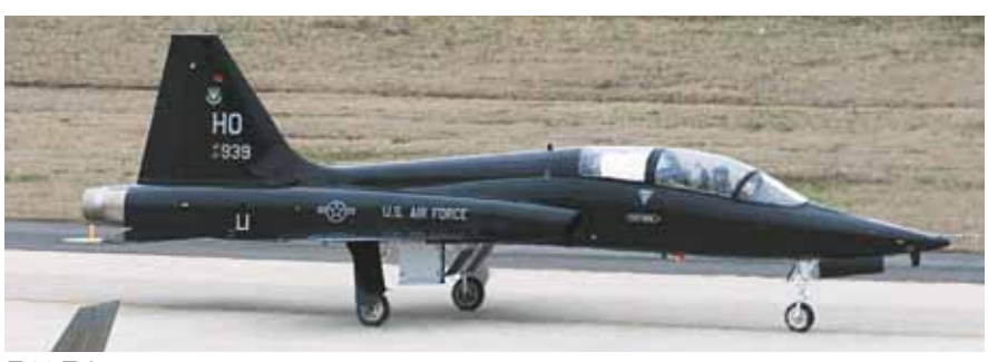
T-38 Talon (SrA. Brian Ybarbo)

Most now used by AETC for advanced bomberfighter training track in JSUPT and IFFT. Used to