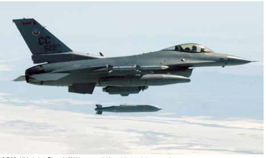
AGM-154 Joint Standoff Weapon

missile. Equipped with "scene magnification" TV seeker allowing pilot to identify and lock on to smaller or distant targets.