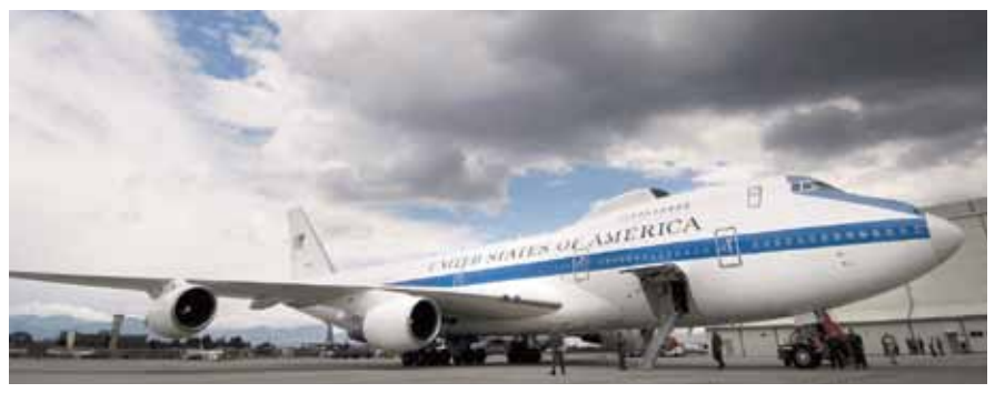
E-4B National Airborne Operations Center

■ E-4B. Hardened against the effects of nuclear explosions, including electromagnetic pulse (EMP). A 1,200-kVA electrical system supports advanced system electronics as well as state-of-the-art communications and data processing equipment such as EHF Milstar satellite terminals and six-channel International Maritime Satellite. A triband radome houses SHF communications antenna. The last aircraft has received the Modernization Block 1