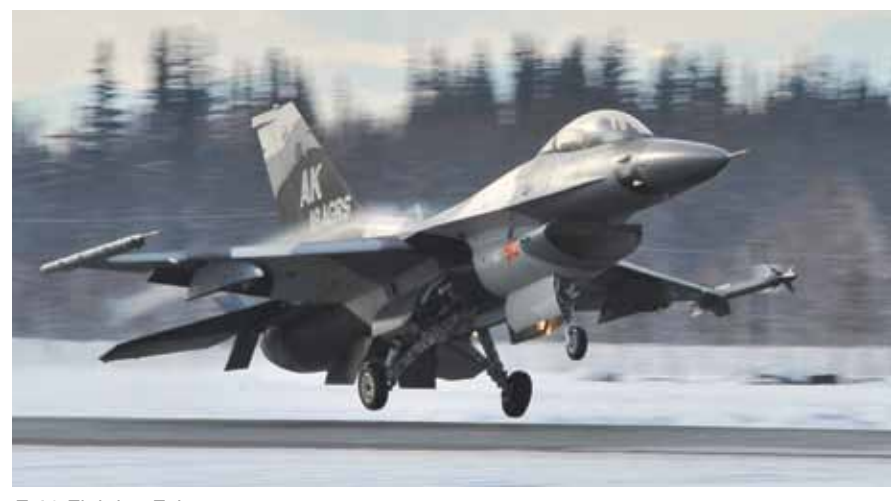
F-16 Fighting Falcon (SSgt. Christopher Boitz)

Workhorse of the USAF fighter fleet. A lightweight fighter supporting the majority of PGM taskings in combat operations. Among the most maneuverable fighters ever built. First flown by USAF in combat in 1991 Gulf War; USAF F-16s flew 13,500 missions, more than any other type. All Block 40/42 and 50/52 F-16s upgraded with the Common Configuration Implementation Program (CCIP), providing stan-