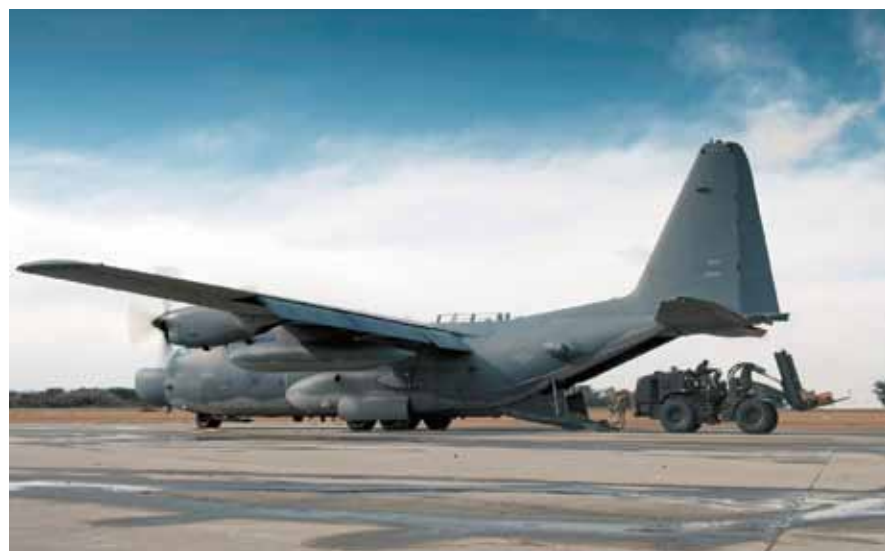
MC-130H Combat Talon II

Function: Air refueling for SOF helicopters and airdrop.