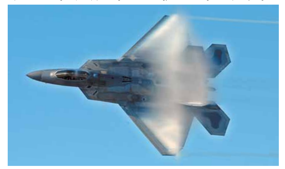
F-22A Raptor (SrA. Zachary Wolf)

■ F-22A. Cockpit fitted with six color LCD panels. The primary MFD provides a view of the air and ground tactical situation, including threat identity, threat priority, and tracking information, with two secondary MFDs showing air and ground threats, stores management, and air threat information. Two additional displays give navigation, communication, identification, and flight information. A HUD shows target status, weapon status, weapon envelopes, and shoot cues. Other equipment includes APG-77 radar, an EW system with radar warning receiver