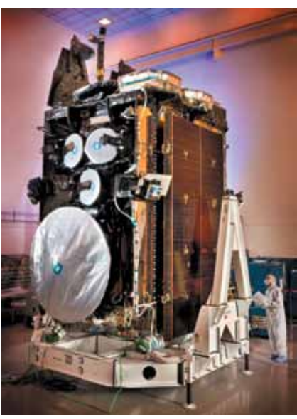
AEHF (Lockheed Martin)

Operator: National Oceanic and Atmospheric Administration (NOAA).