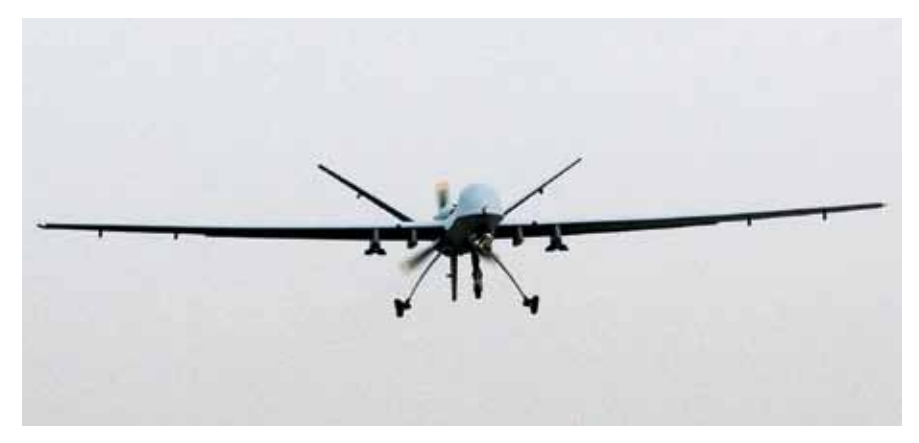
MQ-9 Reaper