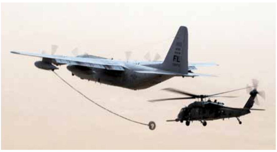
HC-130 King (I) and an HH-60 Pave Hawk (r)

that extends the range of rescue helicopters through in-flight refueling and performs tactical delivery of pararescue jumper (PJ) specialists and/or equipment in hostile environments.