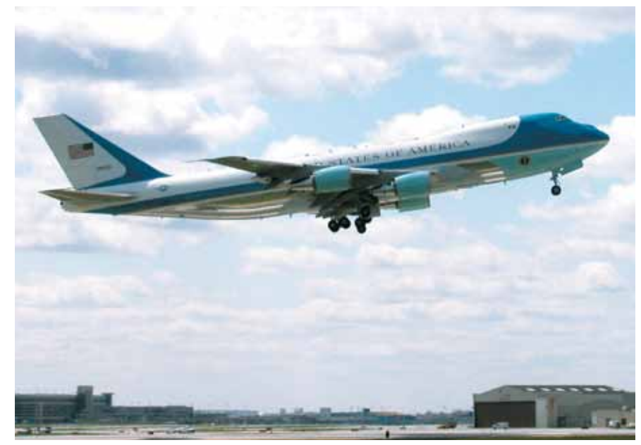
VC-25 Air Force One (Jeremy Mashek)

Performance: speed 630 mph, range 7,800 miles.