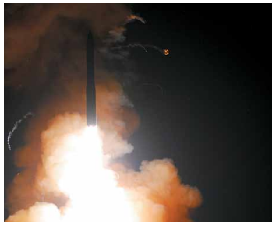
LGM-30G Minuteman III (USAF)

Dimensions: span 12 ft, length 20.8 ft, body diameter 2 ft.