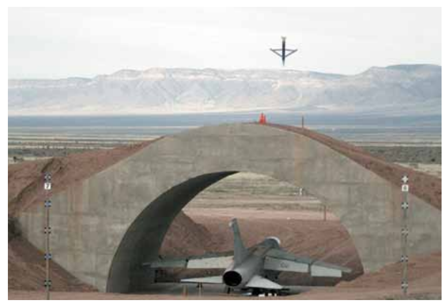
GBU-39 Small Diameter Bomb (USAF)