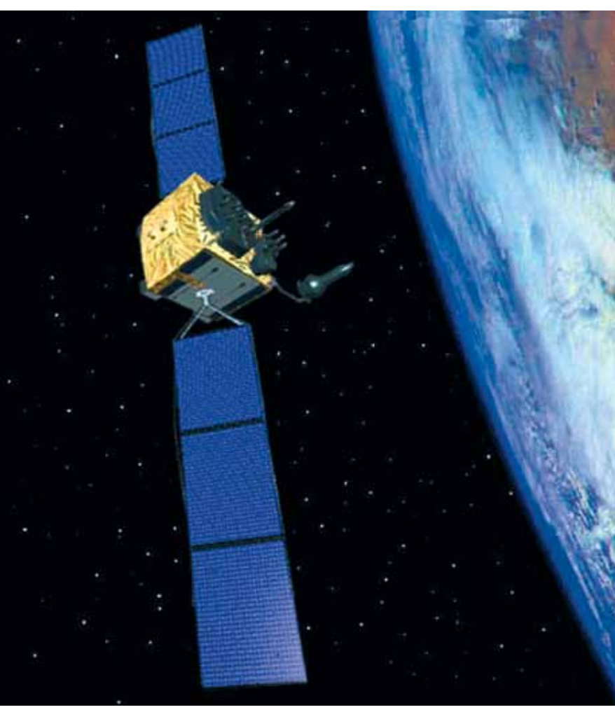
GPS IIF (USAF illustration)

Power Plant: solar panels generating 700 watts (II/ IIA); 1,136 watts (IIR/IIR-M); up to 2,900 watts (IIF). Dimensions: (IIR/IIR-M) 5 x 6.3 x 6.25 ft, span