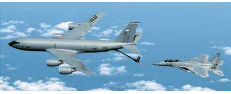
KC-135 Stratotanker (I) and an F-15 Eagle (r)

Function: Cargo and troop transport. Operator: AMC, ANG, AFRC. First Flight: June 30, 1968.