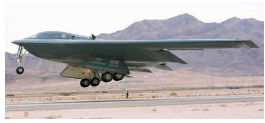
B-2A Spirit

Contractor: Northrop Grumman, Boeing, Vought. Power Plant: four General Electric F118-GE-100