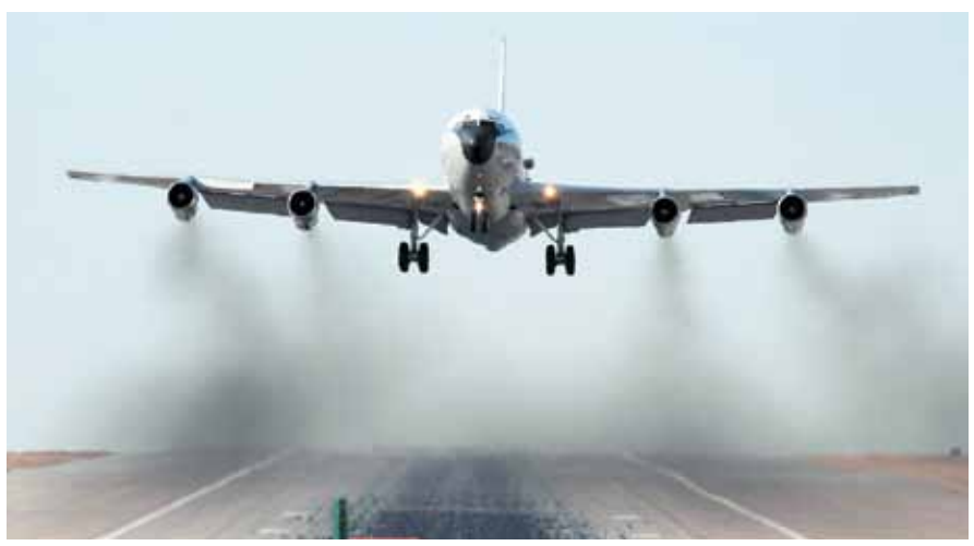
WC-135W Constant Phoenix (Josh Plueger)

Brief: An extended-range, CSAR-configured C-130