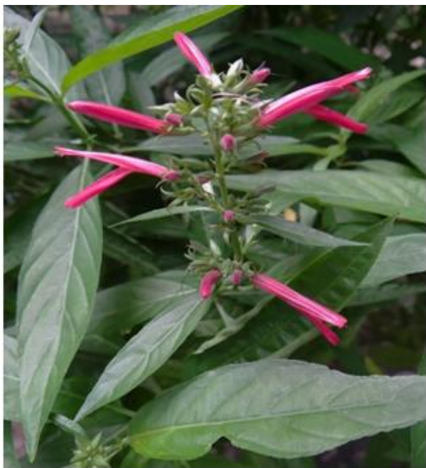
Fig1. Justicia secunda plant

This review will contribute to a deeper understanding of the potential benefits of Justicia secunda and provide insights into its use as a source of bioactive compounds for improving human health.