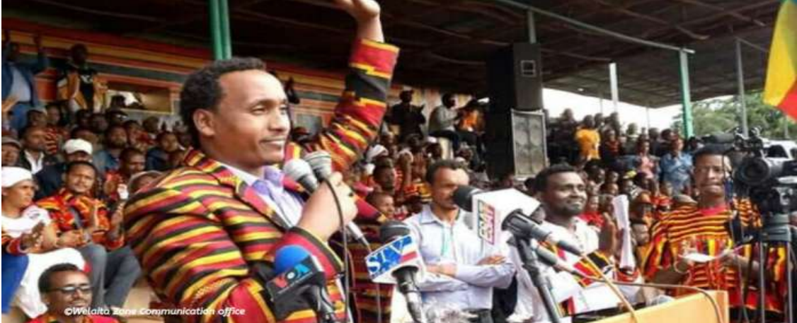
Pic2: Wolayta leaders arbitrarily arrested; and jailed for 10 months until the election 2021. Source: AWLO Media, Ethiopia, June 24,2021.