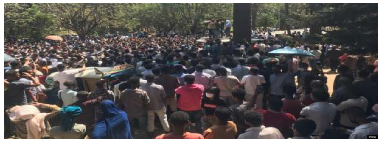
Fig 1.One of the Protests against government in Ethiopia Courtesy: Voice of America (VOA) Amharic service-April 21,2021. No face mask, no social distancing of millions of emotional crowd.

<sup>1</sup>Lets take the assassination of the Honored AmbbassadorSeyoumMesfin and others ,suchasAsmelashGebresilasiewho have knowledge of the world politics, political economics, comparative politics, International relations, political ideiologiesand and other components in practice that various nations follow. Assassinating AmabassadorSeyoumMesfin means murdering the Knowledged and skillful person who can teach, guide and train the young generation so it is equivalent to murdering a generation. In fact, King Hailesilasie I was assassinated by the military junta, President Mengistu who lives in Zembabewe ,exiled after decades of butchering his own people during the proxy war of socialist and capitalist nations; prime minister MelesZenaw's cause for death was put in limbo, and several death attempts practiced on prime minister Abiy Ahmed; but the only surviving political leader is the former prime minster, Hailemariam Desalegn, who volountarily resigned after protests orchastrated inside and outside the country. Serial assassination of political leaders in different seasons cost Ethiopia a lot among of values because matured leaders with knowledge and skill have been murdered with their soft knowledge. The worst political culture needs improvement.