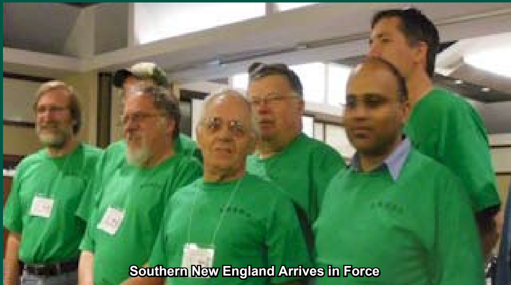
Southern New England Arrives in Force