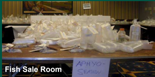
Fish Sale Room