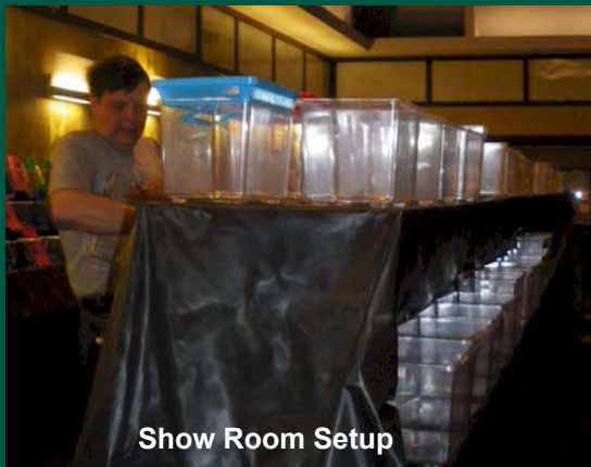
Show Room Setup