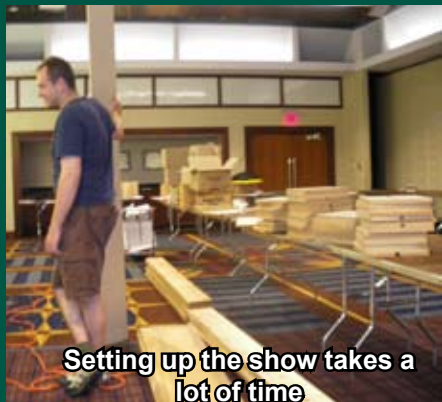
Setting up the show takes a lot of time