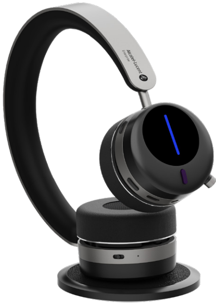
Optional Qi Wireless charging base