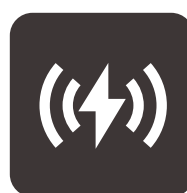
Qi wireless charging