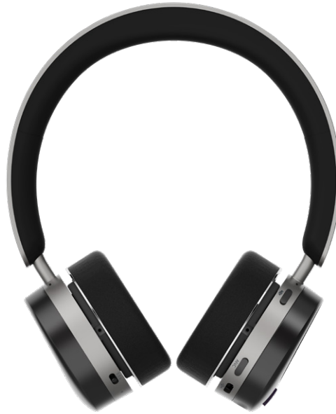
AH80 BT binaural front view