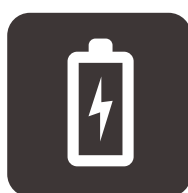
Up to 45 hours battery life