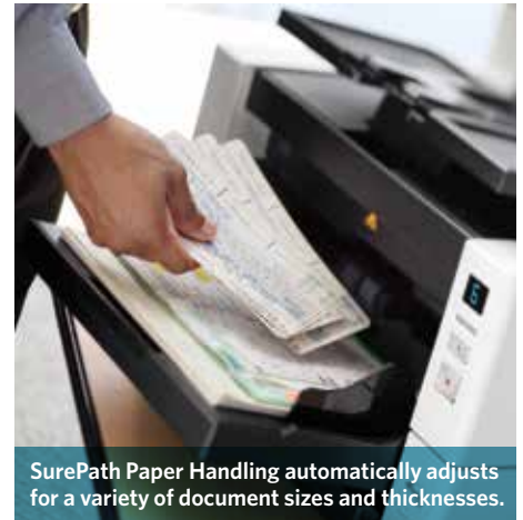
SurePath Paper Handling automatically adjusts for a variety of document sizes and thicknesses.

Optional Kodak Legal Size and A3 Size Flatbed Accessories for added capability to scan bound, oversized and fragile documents.