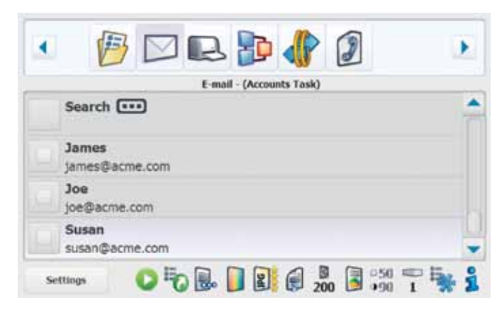
The large 20.3 cm LCD touchscreen makes it easy for everyone to scan and share.