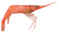
ALASKA SHRIMP Pandalus spp. & Pandalopsis dispar

Also called 'weathervane' scallops, Alaska scallops are known for their sweet flavor and tender, buttery texture. They are the largest scallops anywhere in the world and feature no additives or artificial treatments.