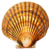
SCALLOPS Patinopecten caurinus

The largest and most flavorful Dungeness Crab comes from Alaska and is an exceptional value due to ease of preparation. It has a distinctly sweet, almost nutty flavor and tender; flaky white meat.