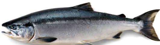
SOCKEYE (RED) SALMON Oncorhynchus nerka

Popular in nearly every foodservice segment, Alaska keta salmon combine economy with excellent texture, flavor and color. It is the firmest of all five species of Alaska salmon.