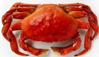
DUNGENESS CRAB Metacarcinus Magister (Cancer Magister)

Two species are actually marketed as snow crab, C. bairdi and C. opilio . Sometimes also called queen crab, they feature sweet, lean meat with a delicate flavor.