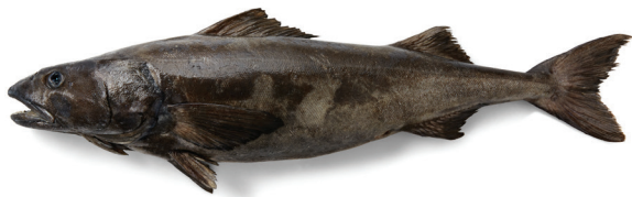
SABLEFISH (BLACK COD) Anoplopoma fimbria

The distinct species of Alaska Whitefish offer their own unique and varied appeal, while sharing a singular reputation as the world's finest. Alaska produces two-thirds of the United States' seafood harvest, much of which is made up of whitefish species. Our whitefish varieties consistently live up to the highest expectations, plus their availability and versatility ensures a variety of options year-round.