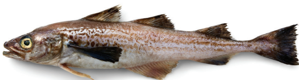
ALASKA POLLOCK Gadus chalcogrammus ( Theragra chalcogramma )

Alaska cod is one of the most popular North Pacific groundfish. Commonly marketed as Alaska cod, Pacific cod, or true cod, but should not be confused with Atlantic Cod.