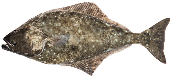
HALIBUT Hippoglossus stenolepis

Alaska has the largest sablefish population in the world. This premium whitefish has high oil content comprised of heart-healthy omega-3 fatty acids. Sablefish is actually not a member of the cod family.