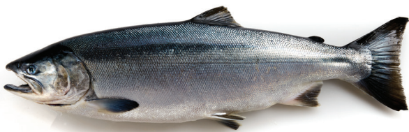
COHO (SILVER) SALMON Oncorhynchus kisutch

King salmon is the largest of the five Alaska salmon species, and is prized for its high oil content and succulent meat.