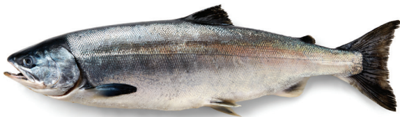
KETA (CHUM) SALMON Oncorhynchus keta

The second largest of the Alaska salmon species, is known for its orange-red flesh. Alaska coho salmon should not be confused with a “silver-brite” keta, a grading term used to describe the skin color of Alaska keta salmon.