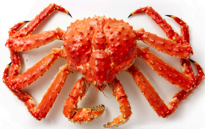
KING CRAB Paralithodes camtschatica

Alaska's pristine, frigid waters are also home to massive and sustainably utilized populations of shellfish from a variety of species, many of which are some of the most demanded in the seafood market. From luxurious crab to succulent scallops, Alaska has shellfish to suit all tastes and dishes, and conservative management ensures a steady supply will be available for generations to come.