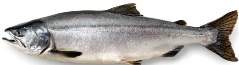
PINK SALMON Oncorhynchus gorbuscha

Sockeye salmon is known for its distinctive rich flavor, deep and lasting red color and firm texture. It is the second most abundant species of Alaska salmon.