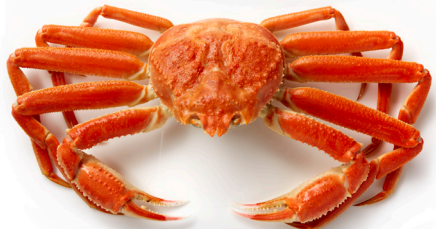
SNOW CRAB Chionoecetes opilio/bairdi

Alaska king crab (most commonly the red and golden varieties) is the largest and most impressive crab and is unmatched in flavor, texture, and regal presentation.