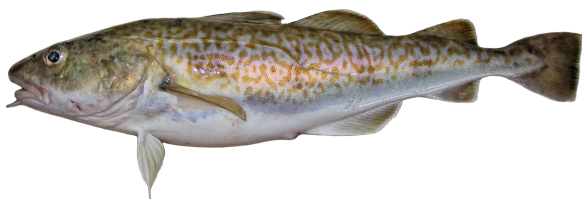
COD Gadus macrocephalus

Alaska halibut is the largest of the flatfish and has a reputation as the world's premium whitefish. Average size ranges from 25-35 lbs. The majority of the domestic supply of halibut comes from Alaska.