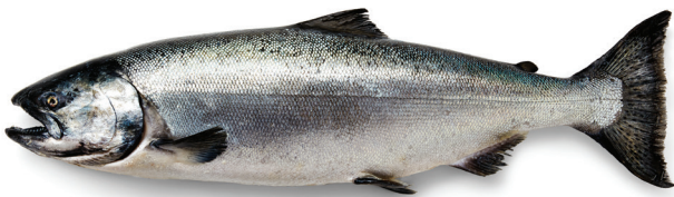
KING (CHINOOK) SALMON Oncorhynchus tshawytscha

Alaska boasts an abundance of five exceptional and delicious species of wild salmon that help you meet every price and performance need. In fact, nearly 95% of wild-caught salmon harvested in North America come from Alaska. Most Alaska salmon are available fresh when the season officially opens in early May through mid-October (with a limited amount of king salmon in the winter months), with a limited amount of king salmon in the winter months, and frozen year-round.