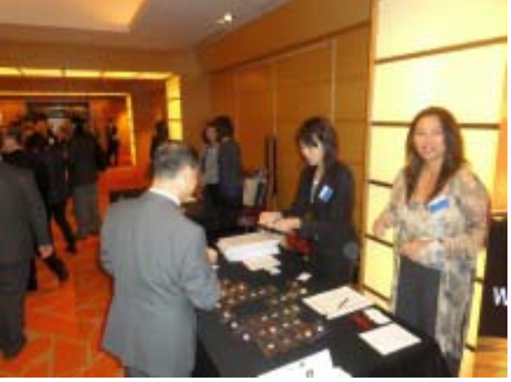
ASMI Japan welcoming guests as doors open