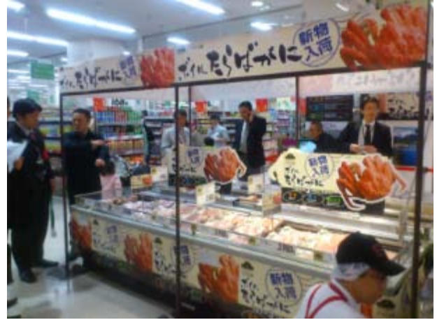
Setting up the king crab display