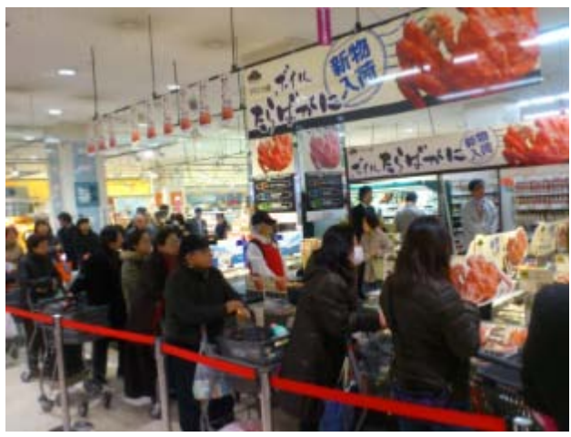
Customers line up for the Alaska seafood fair.