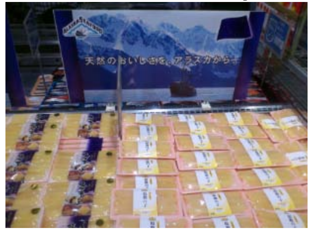
Alaska salted sockeye with Alaska origin Alaska herring roe with Alaska origin identifier POS