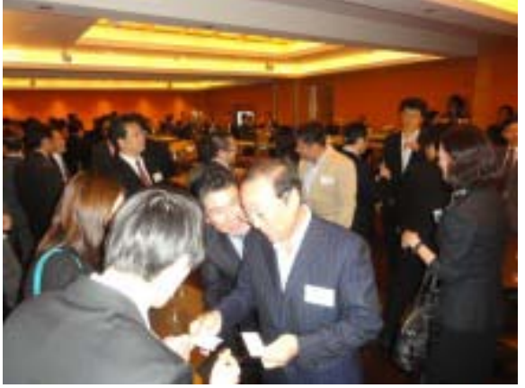
Guests networking prior to the start.