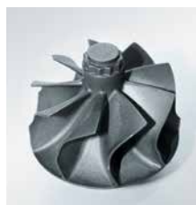
BETTER PERFORMANCE: TURBOWHEELS