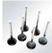
ENVIRONMENT: AUTOMOTIVE VALVES