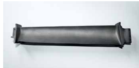
ENERGY SAVINGS: TURBINE BLADES