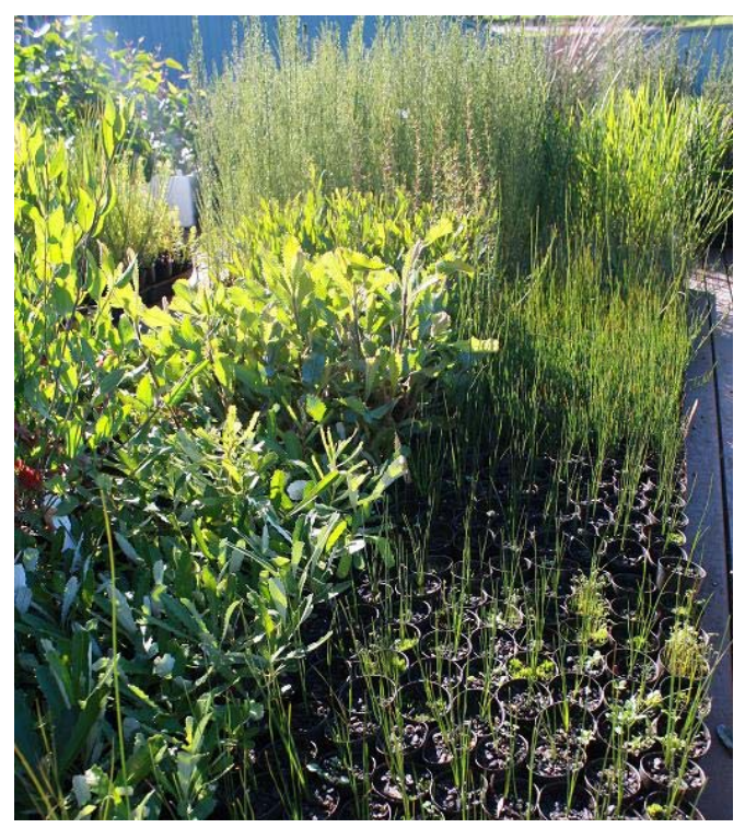
When planning revegetation, use mostly small shrubs and understorey plants from a wide number of species.

You can always plant species that don't regenerate naturally at a later stage.