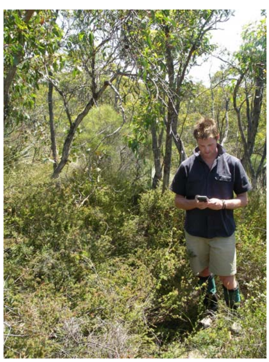
Dense, low understorey, about thigh high, is ideal habitat for bandicoots.