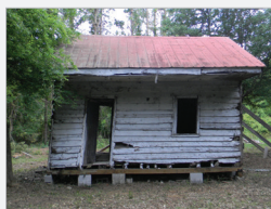
Cabin from Point of Pines Plantation in Charleston County, South Carolina; Gift of The Edisto Island Historic Preservation Society.