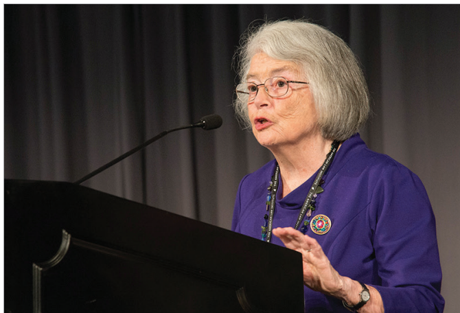
Patricia M. Wald accepting the Henry J. Friendly Medal at the Annual Meeting in 2016

And the global reach of her influence was only enhanced after she left the D.C. Circuit in 1999 and became a judge on the International Criminal Tribunal for the Former Yugoslavia. Among other decisions, she wrote the landmark judgment in the case of Bosnian Serb General Radislav Krstic, which found that the massacre of 8,000 men and boys in Srebrenica constituted genocide. Remarking on her work, our colleague Harold Koh described Judge Wald as an “exuberant pioneer” as a judge in both the United States and abroad and said she “fought for human rights and civil liberties everywhere long after many others would have laid down their pens.” But she was not done.