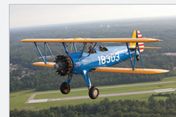
Training aircraft used by Tuskegee Institute; Manufactured by: Boeing Corporation, ca. 1944.