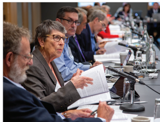
Consumer Contracts project meeting