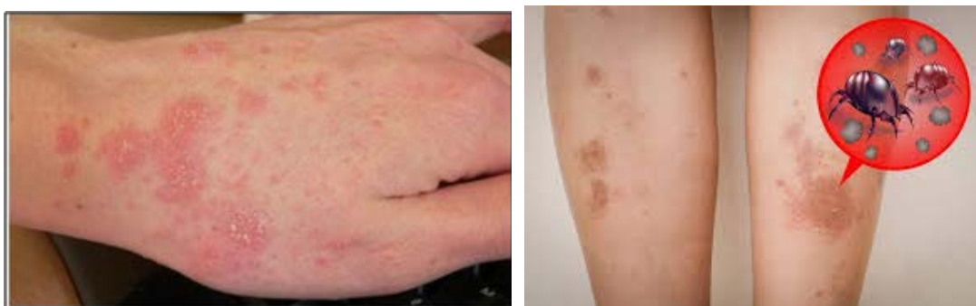
Figure 2. Symptoms of a dust mite allergy.

Citation: Vandoost H. Biology of house dust mites as an allergens and methods for their control. J Clin Resp Med. 2022;6(1):105