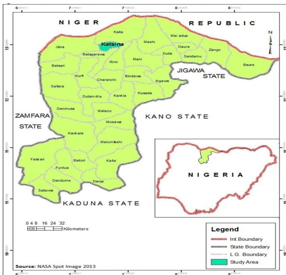
Figure 1. Katsina State showing sampled town and local government areas.

a population of 3,878,344 million and a population density of 160.3/km 2 . The climate of Katsina State is characterized by two well marked seasons, the rainy season, extending from May until September and the dry season from October to April.