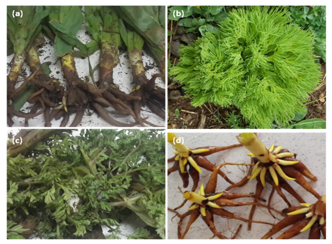
Figure 1. (a) Eremurus spectabilis M.Bieb., (b) Ferula orientalis L., (c) Chaerophyllum macrospermum (Spreng.) Fisch. & C.A.Mey plants, (d) Eremurus spectabilis M. Bieb. roots and rhizomes.

The surfaces of the leaf explants and the shoots containing single nodes were sterilized by shaking the samples in 15% commercial sodium hypochlorite for 15 minutes. Then, they were rinsed with bidistilled water 3 times, 5 minutes for each repetition ( Fig. 2a, 2b, 2c, 2d ). Sterilized materials were put on a sterile blotting paper and cleansed of their excess water ( Fig. 2e, 2f ). Rhizomes were prepared for planting by vertically and horizontally cutting their sides in strips ( Fig.2g, 2h, 2l ). To obtain the single-node explants, the nodes that also had shoots half a centimeter above and below were taken and their leaves were removed ( Fig. 2i, 2j ). To obtain leaf explants, thin strips were taken from the sides and edges of the leaves and prepared for planting ( Fig. 2k ). All steps were carried out under aseptic conditions in a laminar flow cabinet.