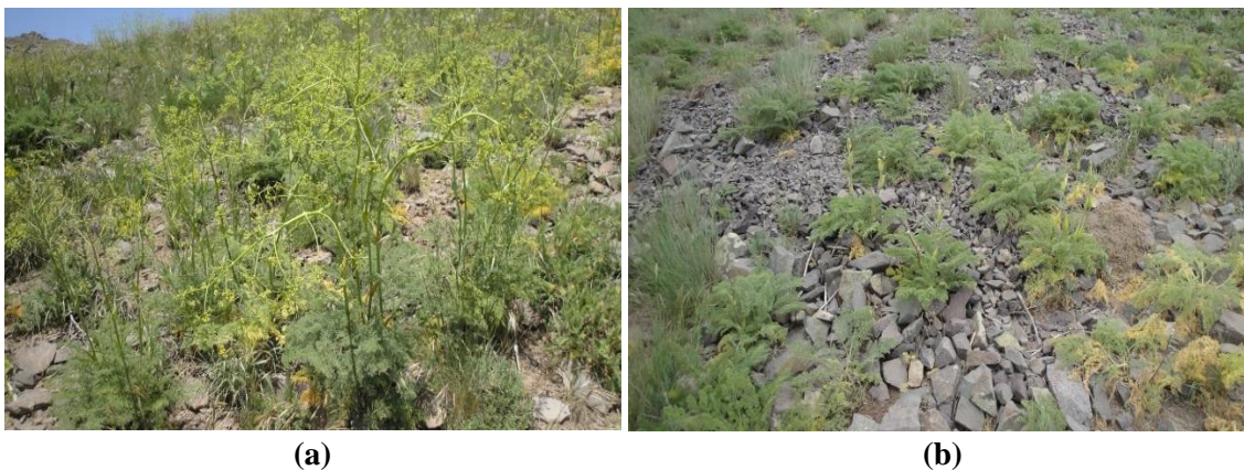
Figure 2. Ferula ovina (Boiss.) Boiss. a perennial forbs growing in Zanzan province in Iran, a) The habitat of Shilander and b) The habitat of Zaker-Khanchay and