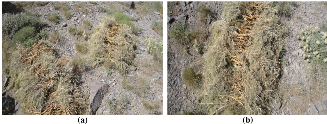
Figure 3. Over-harvesting of F. ovina for providing winter forage for livestock in the study area by locals, a) and b) the habitat of Soltanieh