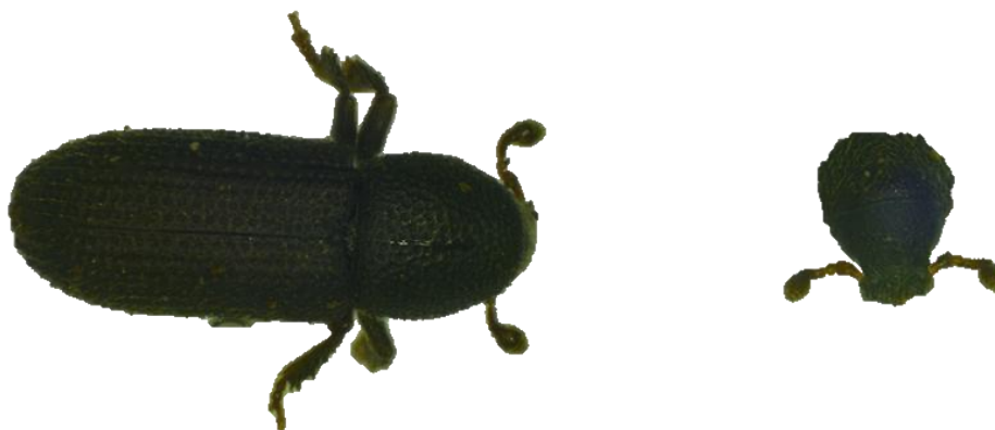
Figure 2. Hylastes opacus Erichson

We obtained only six adult of C. hispidulus individuals from log traps in Balıkesir and Çanakkale province in 2014. C. hispidulus can be differentiated from other Turkish species of the genus Crypturgus (except C. pusillus , C. cylindricollis and C. parallelocollis ) by shiny elytra and with round punctures of striae and elytral declivity with individually placed setae. It can be distinguished from C. pusillus by fine pronotum with sparsely punctured and elytral discs and sides with erect and long setae. It differs from C. cylindricollis and C. parallelocollis in terms of sizes (Grüne, 1979; Freude et al., 1981; Lompe, 2002; Jordal and Knížek, 2007). Its adults are 1.2-1.3 mm long and have the following features: interstriae with rows of white to light brown, short, thick and filiform setae; body black (Fig. 3).