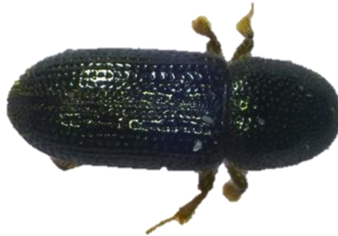
Figure 3. Crypturgus hispidulus Thomson, C. G.

Germany, Hungary, Italia, Latvia, Lithuania, Norway, Poland, Slovakia, Slovenia, Sweden, Switzerland, and Ukraine (GBIF, 2017; Fauna Europaea, 2018).