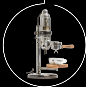
first espresso machine