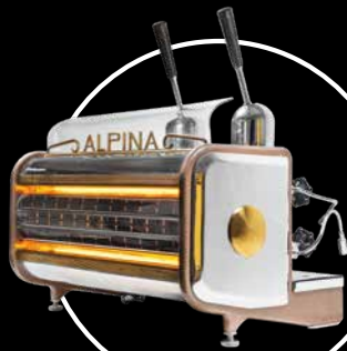
first Alpina machine with an espresso hand lever