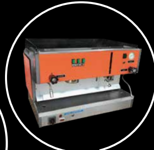
First time-controlled espresso machine K3