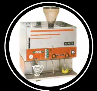
Alpina Vario – fully automatic filter machine