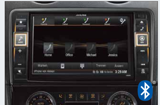
Latest Bluetooth® technology: Hands-free phone calls and audio streaming

The built-in Bluetooth® module allows wireless connection of a mobile phone for hands-free communication, while frequent software updates ensure full compatibility with the latest phones. A very intuitive user interface makes it very easy to operate and also includes a speed dial function for the most frequently called numbers. Bluetooth® also enables audio streaming from the phone: audio content or even internet radio can be wirelessly transferred to the X800D-ML.