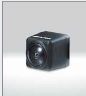
Optional Multi-View Camera (HCE-C252RD)