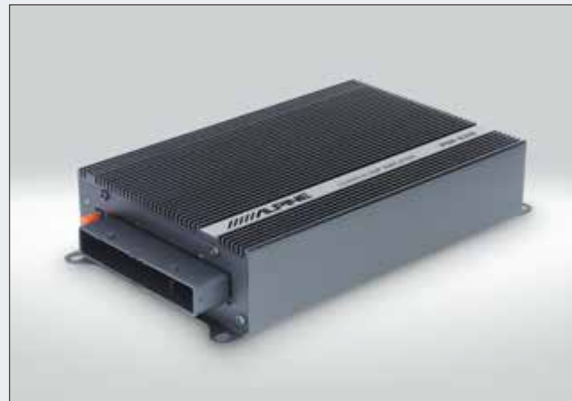
Digital High-End Amplifier for an audiophile sound experience (PDP-E310ML).

* For upgrading the ML W164 original entry sound system. Can also be used with the original factory radio.