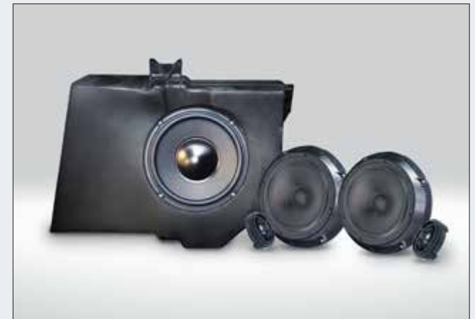
Premium Speaker and Subwoofer System upgrade (SPC-100ML).

* For upgrading the ML W164 original entry sound system. Requires PDP-E310ML.