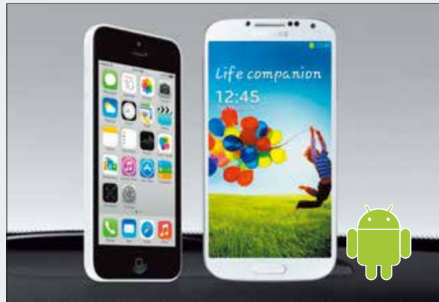
Stay Connected: the X800D-ML is compatible with the latest smartphones

The Alpine system ensures compatibility with the latest smartphones such as the iPhone 5S/C, the Samsung Galaxy S5 or the HTC One. This offers many advantages: you can enjoy digital content stored on your phone such as music or video files, access your phonebook or simply charge your phone. You can even activate SIRI and voice-control your iPhone for maximum comfort and driving safety.