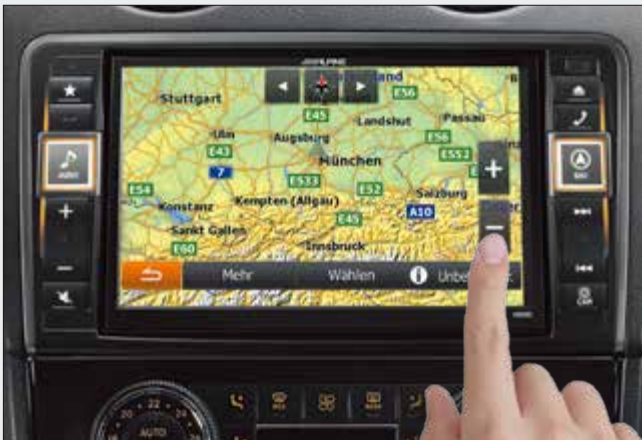
The 20cm high resolution WVGA touch screen: a cinematic experience in your dashboard (X800D-ML)

The 8-inch (20.3 cm) high resolution display is 60% larger than the original ML display and features the latest video technology for outstanding picture clarity, contrast and resolution. This allows navigation maps to be displayed in stunning detail, while movies or video clips become a real cinematic experience. It also contributes to driving safety: navigation map details are easier to see and destination input keys appear larger and are easier to operate.