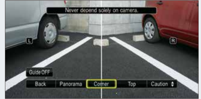
Multi-view: split screen provides sharp images of left and right rear.

The rear-view camera automatically activates when reversing and also mutes the audio so you can hear the parking sensor signals. You not only have a clear view to the rear, you can also see useful distance guides that are programmed to exactly match the ML measurements for easier parking. You have a choice of four viewing modes. Multi-view splits the screen so you have a clearer view of both left and right behind the car. Top view is very convenient when backing up to hook up a trailer, enabling you to get within centimetres of the trailer. There's also a picture-in-picture function that shows the regular rear view in a small screen when you've selected a special viewing mode.