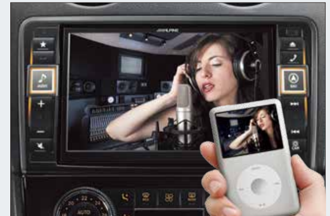
Mobile entertainment: connect your digital or analog mobile devices for video entertainment on the road

The X800D-ML allows you to enjoy movies, music videos or TV shows from many different sources, such as DVDs from the built-in optical drive, USB sticks, latest smartphones with HDMI output or portable video devices connected to the A/V connector (optional cables may be required). You can also connect your iPod or iPhone to enjoy your video content on the large 8-inch display. For driving safety the video playback feature is only available if the vehicle is not in motion.