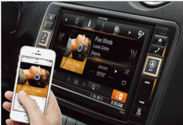
Made for iPod: see the album artwork and song information at one glance

If you connect an iPod, USB device or smartphone you have easy access to your full music library. You can easily search content by artist, album, song, genre or playlist. Alphabetic search will help you to browse quickly through your library to find what you are looking for. Audiobooks and podcasts are also a great way to keep you entertained.