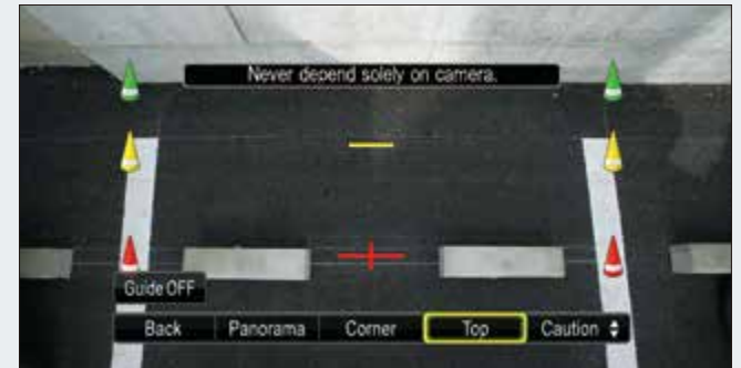
Top view: convenient for precise reversing, for example to hook up a trailer.