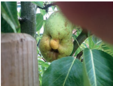
A right pear!