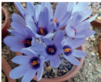
Crocus mathewii 'Pink Princess'

despite poor weather and our local group show taking place on the Sunday.