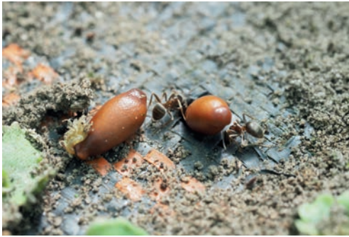
Ants with J.diphylla seeds

After a few hours the ants had increased the size of the nest entrance and taken in the seeds.