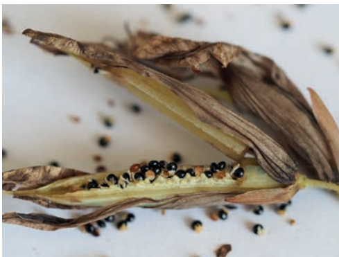
I. macrocapnos seedpod

I watched the flowers fade and was quite disappointed to see that they just became papery with no apparent seed formation. This was not a surprise because I thought that my colony which was derived from just a single plant might not be self-fertile. In June I removed the dead flower heads and peeled apart the brittle flower parts and was delighted to find that