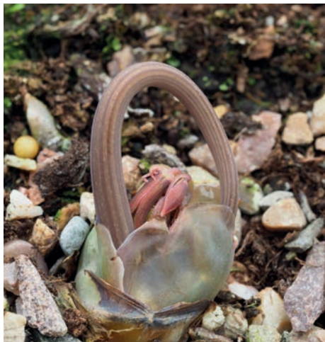
I. macrocapnos emerging

It was discovered by Ernest Wilson in 1904 on Mount Emei, and entered cultivation when Veitch and Sons grew plants from seed collected by Wilson.