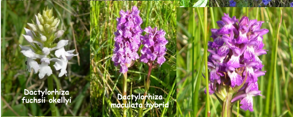
Dactylorhiza fuchsii okellyi