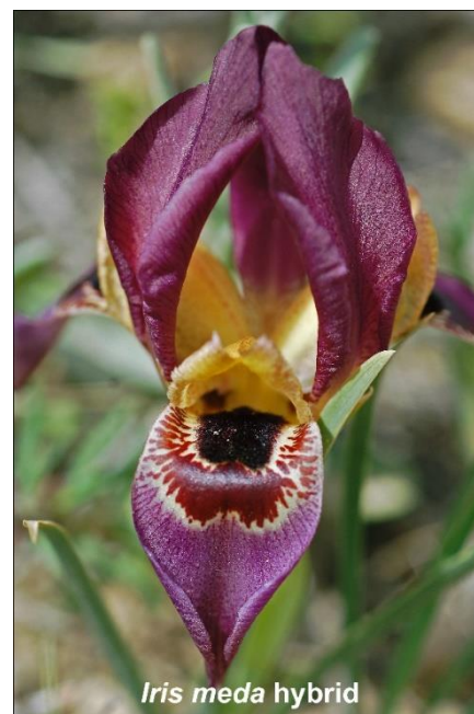
Iris meda hybrid

In particular, in one area of NW Iran it is present in hybrid form, though it is unclear what the other parent is. These magnificent forms have been described as ‘moleskin’ Iris es as the signal patch on the falls is purple-black in colour.