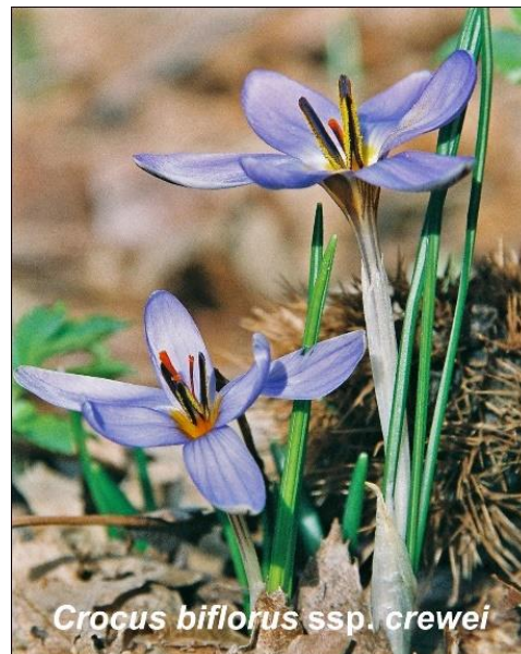
Crocus biflorus ssp. crewei

The genus Crocus has had a lot of attention in recent times, particularly by Janis Ruksans and colleagues, and it is becoming a bit like Ophrys in the orchid world. However, two species that we have found deserve attention. The first is a hybrid that is found in NW Turkey near Lake Bolu, between yellow-flowered Crocus ancyrensis and blue C. abantensis . The hybrid is an attractive brown shade. Also unusual is a blue form of C. biflorus ssp. crewei (normally white with black anthers) found in the southern Taurus Mountains. Both are quite spectacular variants.