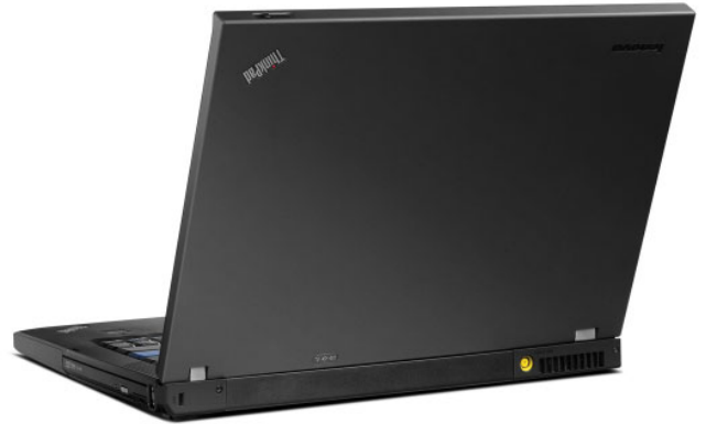
Lenovo ThinkPad T400