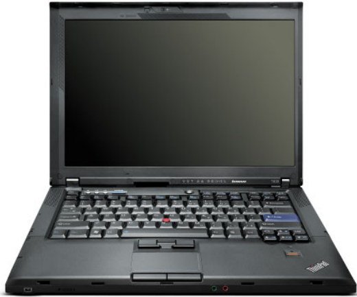
Lenovo ThinkPad T400