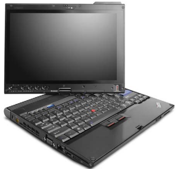
Lenovo ThinkPad X200 Tablet with frameless screen for pen