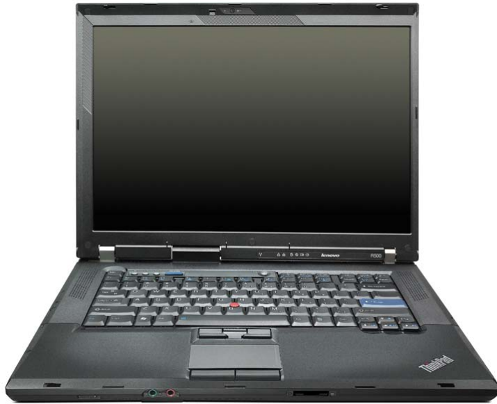
Lenovo ThinkPad R500