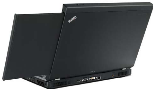
Lenovo ThinkPad W700ds