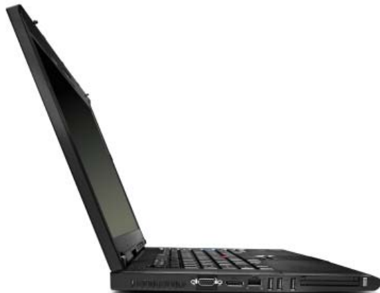
Lenovo ThinkPad W500