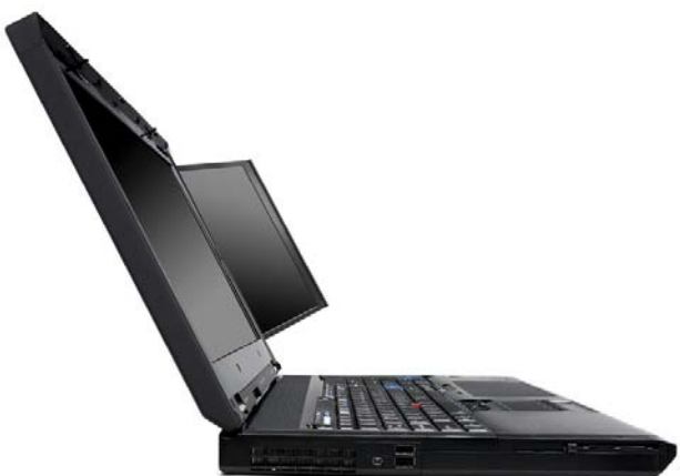
Lenovo ThinkPad W700ds