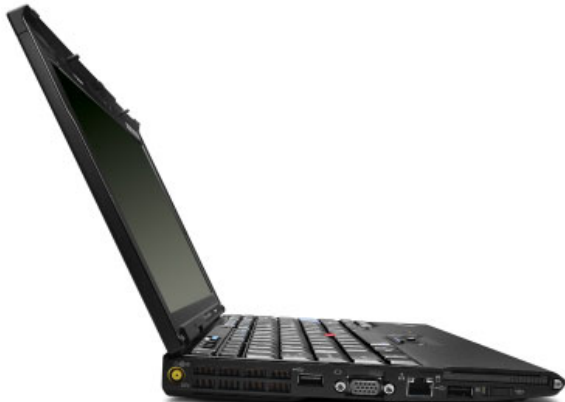
Lenovo ThinkPad X200s