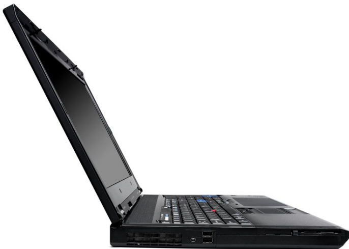
Lenovo ThinkPad W700