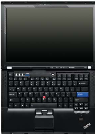
Lenovo ThinkPad R400