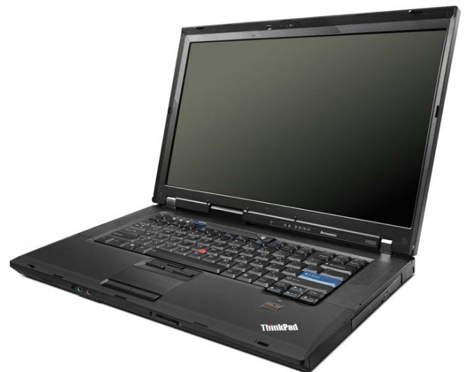
Lenovo ThinkPad R500