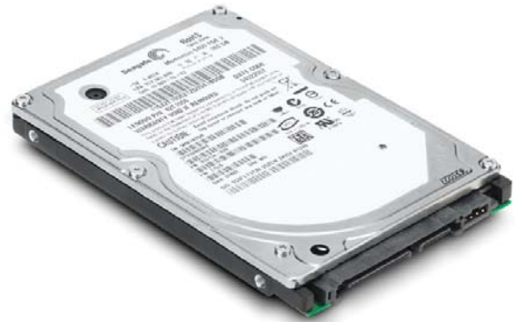
160GB Disk 9.5mm SATA 1.5Gb/s (7200 rpm) 41N5737