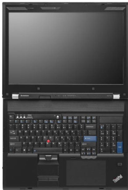
Lenovo ThinkPad W700