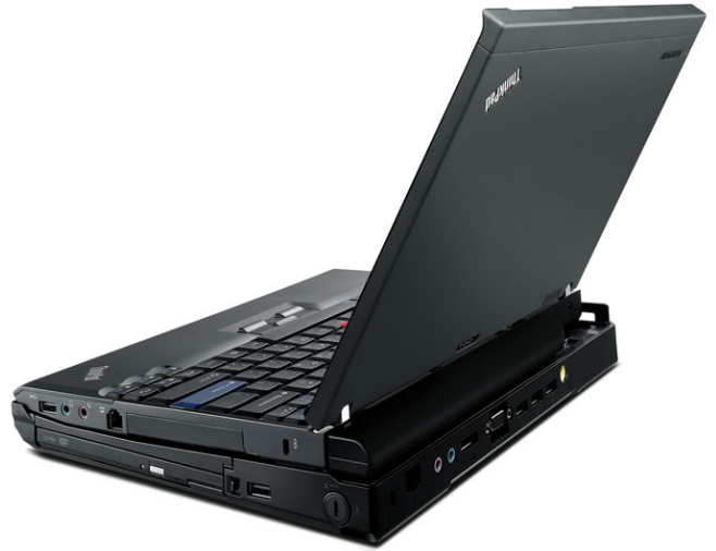
Lenovo ThinkPad X200s with optional X200 UltraBase, DVD Burner, and 9-cell Battery