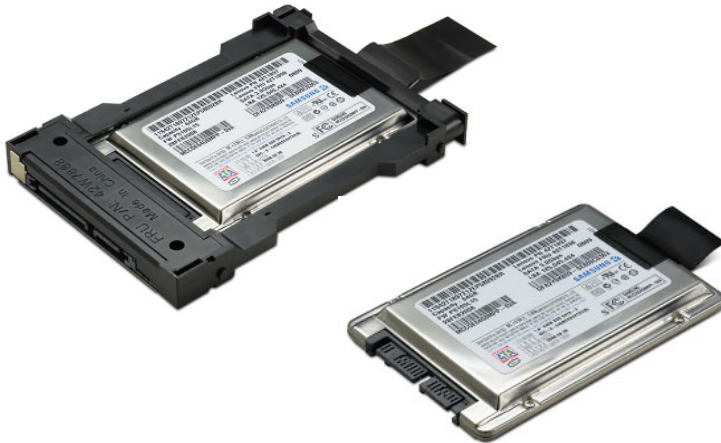
128GB Solid State Drive SATA 3.0Gb/s 1.8" (with 2.5" cover) 43N3406