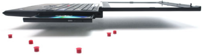
Lenovo ThinkPad X300, X301