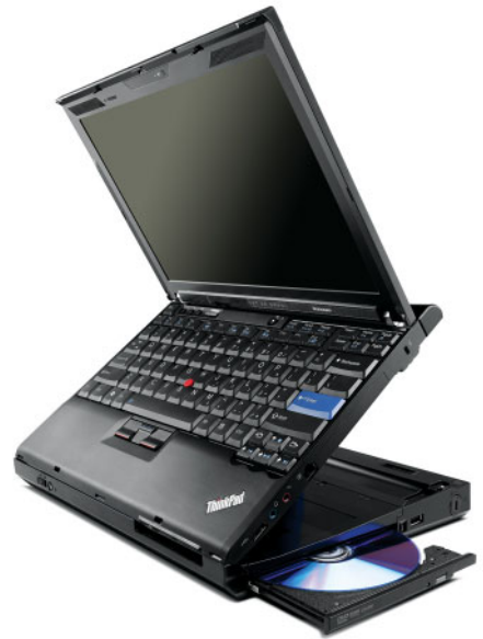
Lenovo ThinkPad X200s with optional X200 UltraBase, DVD Burner, and 9-cell Battery