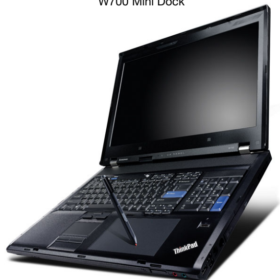
Lenovo ThinkPad W700