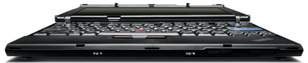
Lenovo ThinkPad X200s