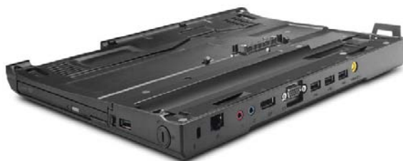
Lenovo X200 UltraBase