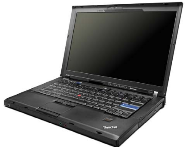
Lenovo ThinkPad R400