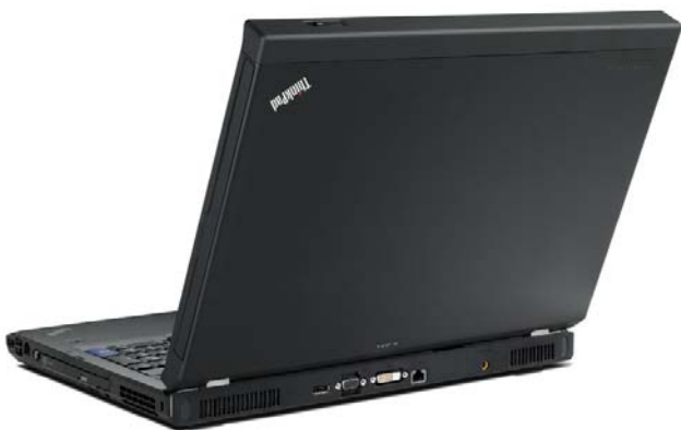
Lenovo ThinkPad W700ds