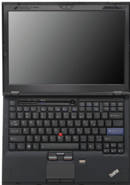
Lenovo ThinkPad X300, X301