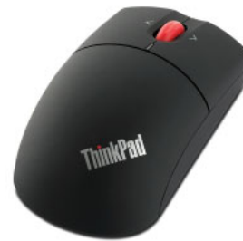
Laser Tilt Wheel Travel Mouse (Bluetooth) 41U5008