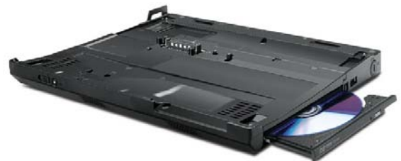
Lenovo X200 UltraBase with optional DVD Burner