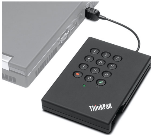
USB 2.0 Portable Secure Hard Disk 160GB 43R2018 320GB 43R2019