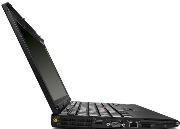
Lenovo ThinkPad X200