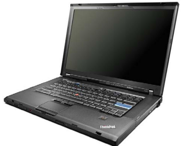
Lenovo ThinkPad T500