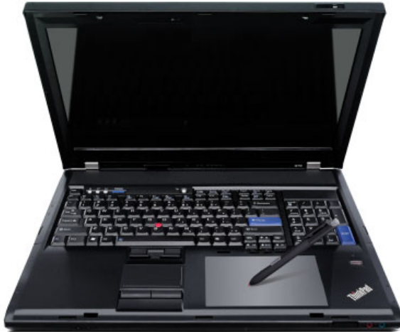
Lenovo ThinkPad W700