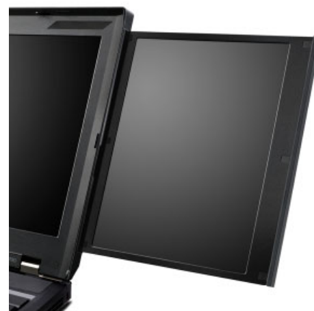
Lenovo ThinkPad W700ds