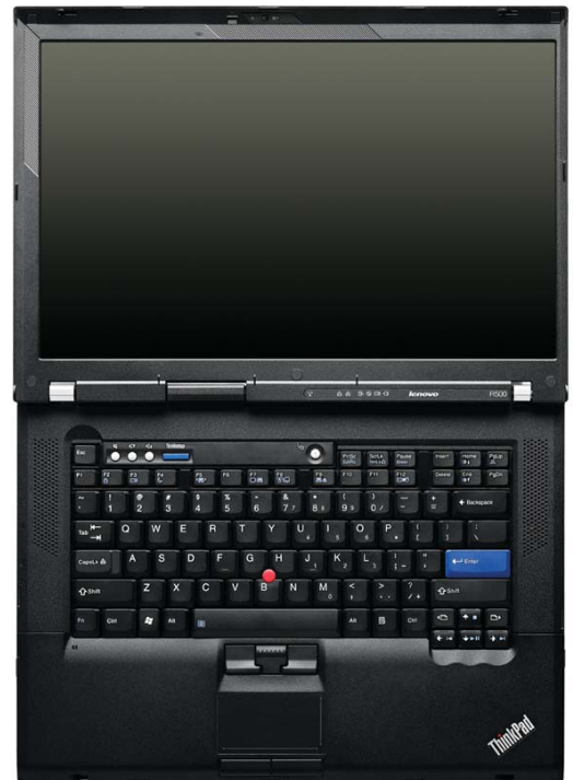
Lenovo ThinkPad R500