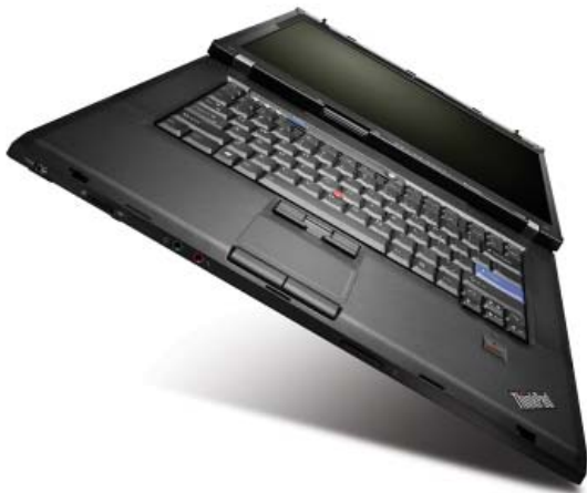
Lenovo ThinkPad W500