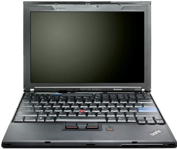
Lenovo ThinkPad X200s