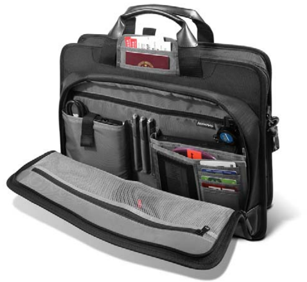
ThinkPad Business Topload Case part number 43R2476