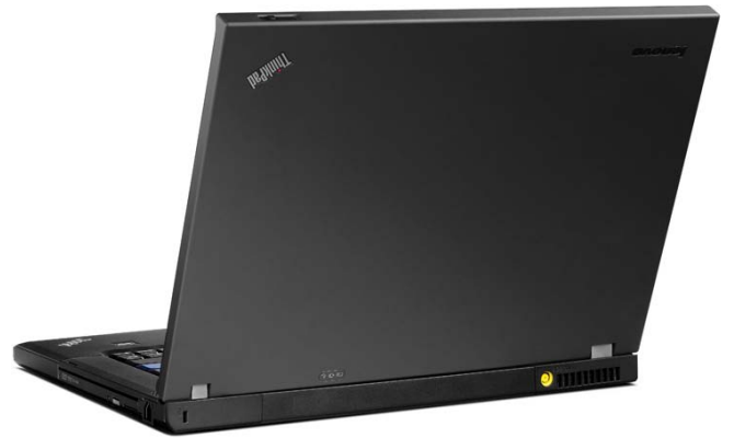
Lenovo ThinkPad T500