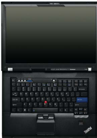
Lenovo ThinkPad T500