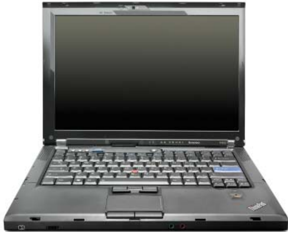
Lenovo ThinkPad R400