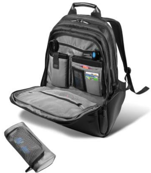
ThinkPad Business Backpack part number 43R2482