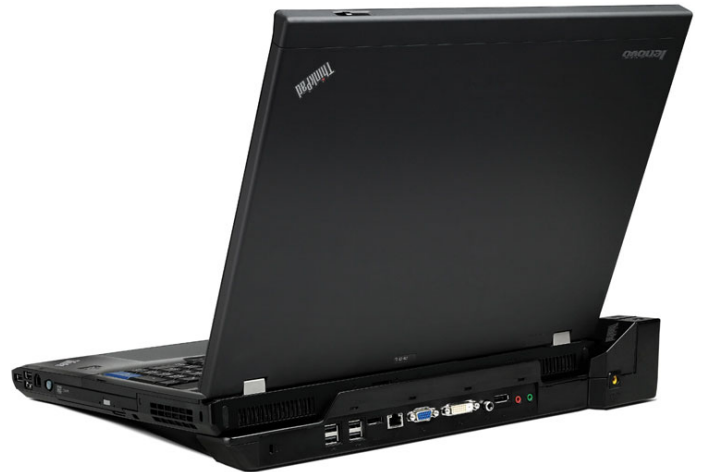
Lenovo ThinkPad W700 with W700 Mini Dock