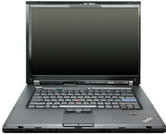
Lenovo ThinkPad W500