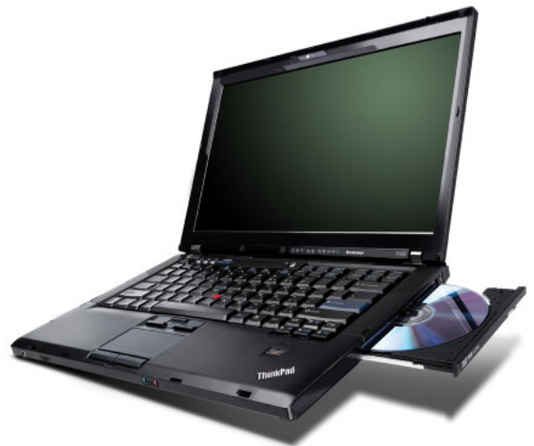
Lenovo ThinkPad T400