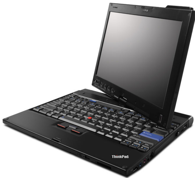
Lenovo ThinkPad X200 Tablet with touchscreen for finger and pen