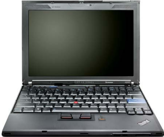
Lenovo ThinkPad X200