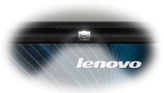
ThinkLight on Lenovo ThinkPad R400