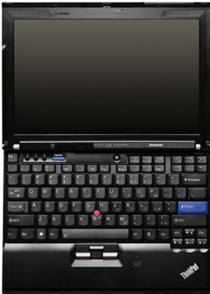
Lenovo ThinkPad X200