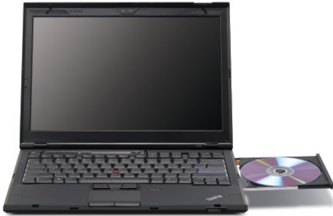
Lenovo ThinkPad X300, X301