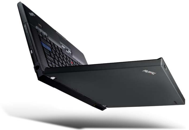
Lenovo ThinkPad W500