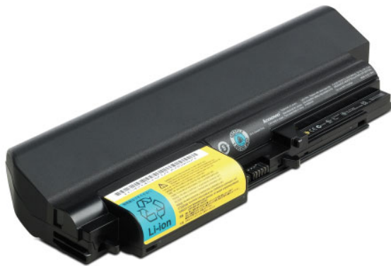
T/R 14W High Capacity Battery 9-cell 43R2499