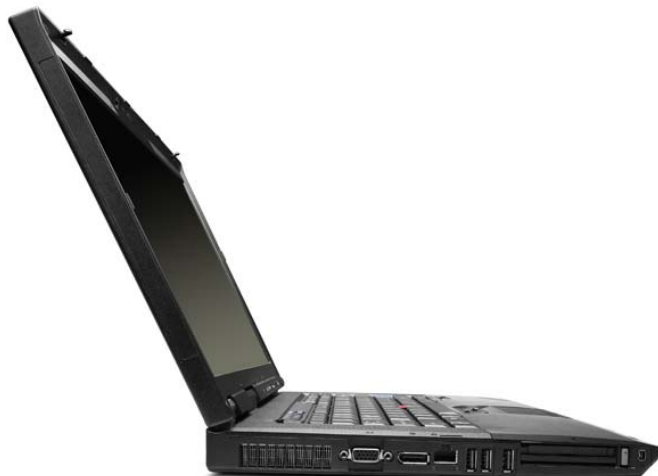
Lenovo ThinkPad R500