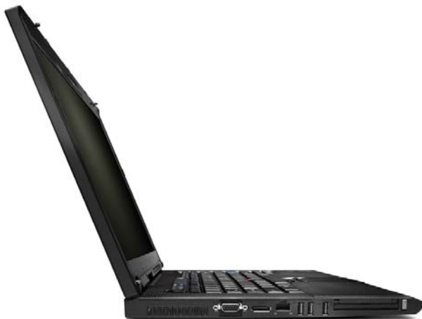
Lenovo ThinkPad T500