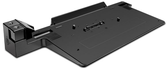
Lenovo ThinkPad W700 Mini Dock