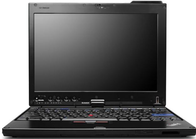
Lenovo ThinkPad X200 Tablet with touchscreen for finger and pen