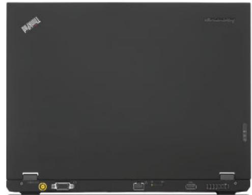
Lenovo ThinkPad X300, X301