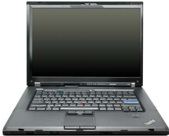
Lenovo ThinkPad T500