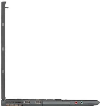
Lenovo ThinkPad X300, X301