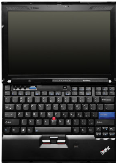
Lenovo ThinkPad X200s