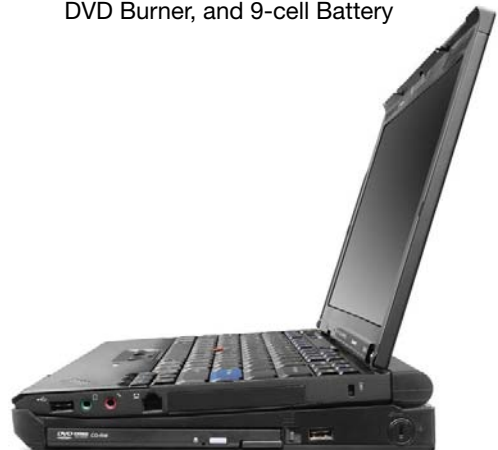
Lenovo ThinkPad X200 with optional X200 UltraBase, DVD Burner, and 9-cell Battery