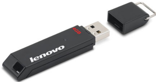
USB 2.0 Security Memory Key 4GB 41U5120