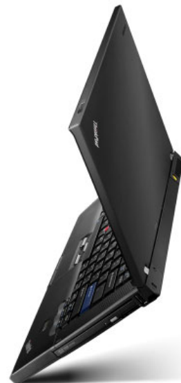
Lenovo ThinkPad T400