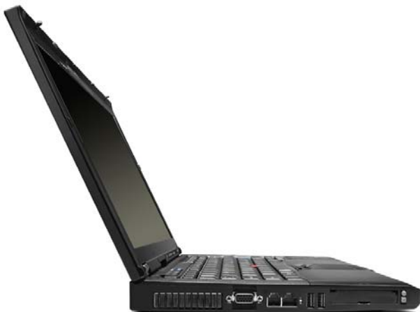
Lenovo ThinkPad R400