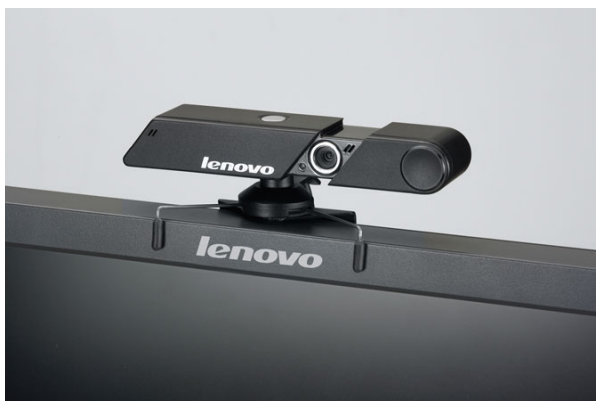
USB 2.0 Lenovo Webcam 40Y8519