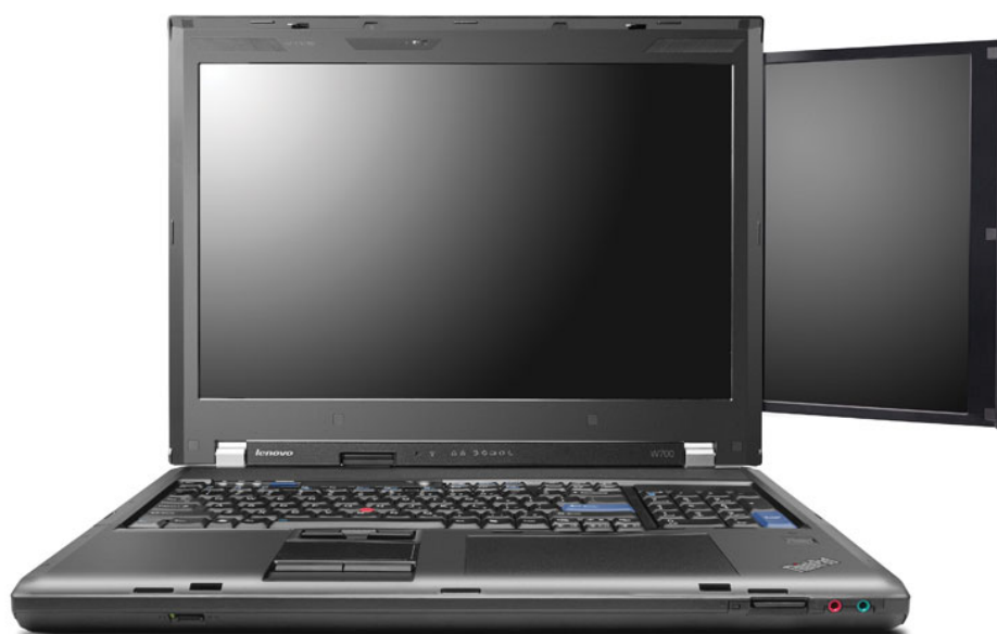
Lenovo ThinkPad W700ds