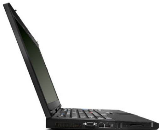
Lenovo ThinkPad T400