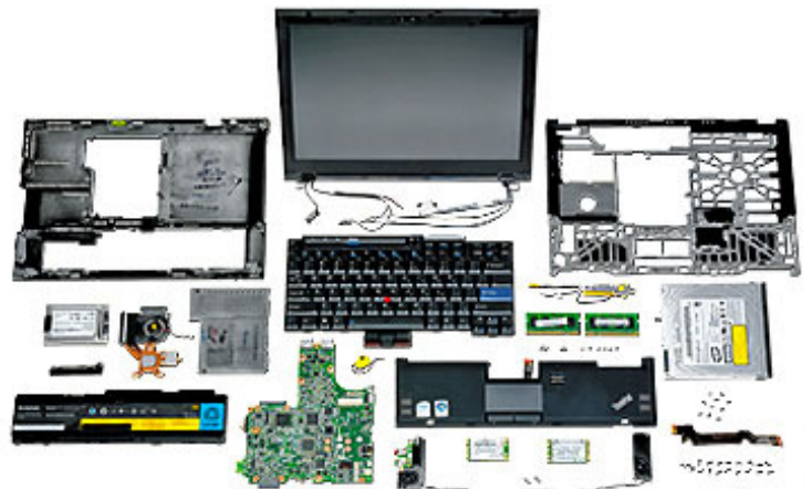
Lenovo ThinkPad X300, X301