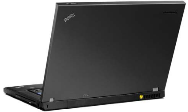
Lenovo ThinkPad W500