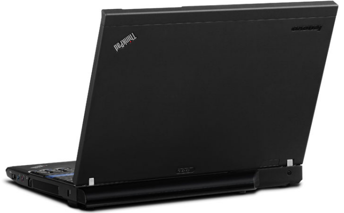
Lenovo ThinkPad X200 with 9-cell Battery