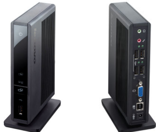
USB 2.0 Lenovo Enhanced Port Replicator 43R8770