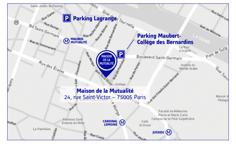
This document is a free translation of the official French version of the Notice of Meeting which is available on request.

Parking: parking Maubert-Collège des Bernardins & Lagrange