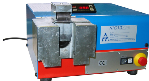
VARIOMAT with flaring unit