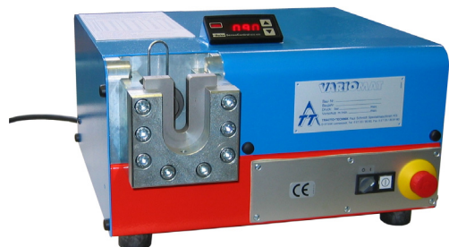
VARIOMAT with cutting ring assembly unit

Combined tube working device for cutting ring assembly and flaring