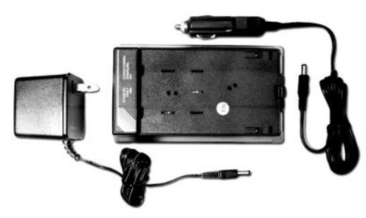
WPPN4002BR Shown With Optional Cigarette Lighter Adapter

The MCC utilize negative pulse charging technology that will help extend battery life and enhance battery operation. It will safely condition and charge your specified NiCd and NiMH batteries in approximately one to two hours. The MCC controls heat buildup due to its charging and termination algorithms and maintenance mode allows batteries to be safely left on the charger for extended periods of time. And now there is an Instant Fault Detection (IFD) feature which detects faulty radio batteries in seconds, which notifies the user that the battery will not operate at peak performance. Optional accessories are available allowing these chargers to be used in both AC and DC environments providing optimal charging flexibility.