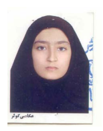
Zahreh Nasser-Torfi

• A man from Shiraz identified to Amnesty International only by the name "Amir" who had been sentenced to 100 lashes on charges of carrying out homosexual activities in 2004 alleged that he had been tortured and harassed and threatened with death by security forces.