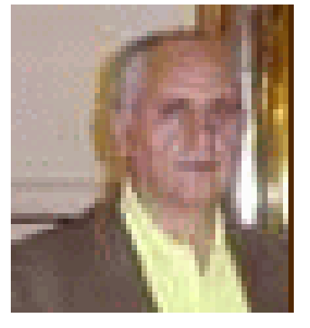
Mohsen Hakimi © Private