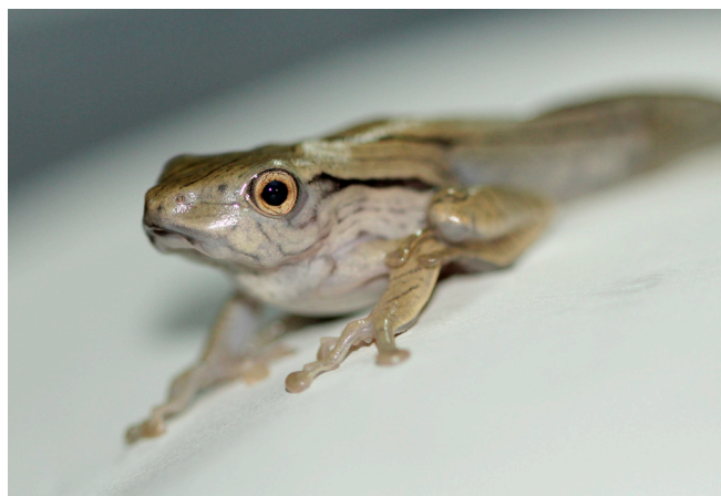
Figure 4. Metamorph P. ottilophus exhibiting characteristic longitudinal stripes.

Tetra Pro Algae (Tetra Werke Melle, Germany) and Hikari algae wafers (Kyorin Food Industries, Ltd. Japan).