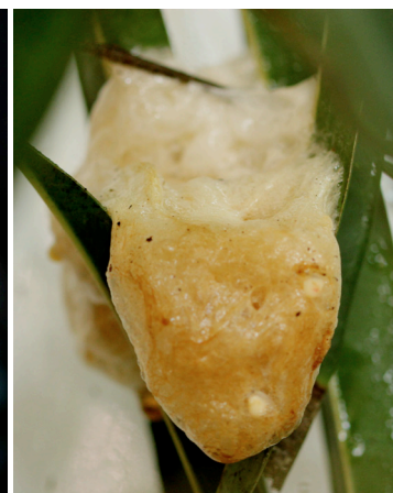
Figure 2. Foam nest deposited on F. binnendijkii .

and the number of clutches per female was not recorded. Amplexus is axillary (Fig. 1). Fourteen fertile foam nests were produced by the five females from April 10 th - November 4 th 2014. Egg laying was observed to take place five times in the early morning at approximately 06:00 hrs. Three of the nests were deposited on F. binnendijkii leaves (Fig. 2), and 11 clutches were deposited on the glass sides of the vivarium. On 19 th May 2014 the process of nest construction was observed in its entirety, the process took approximately 45 minutes. Once the foam nest had been constructed the female created a chamber in the centre of the nest using circular motions of her hind feet, eggs were then deposited in the cavity in the centre of the nest.