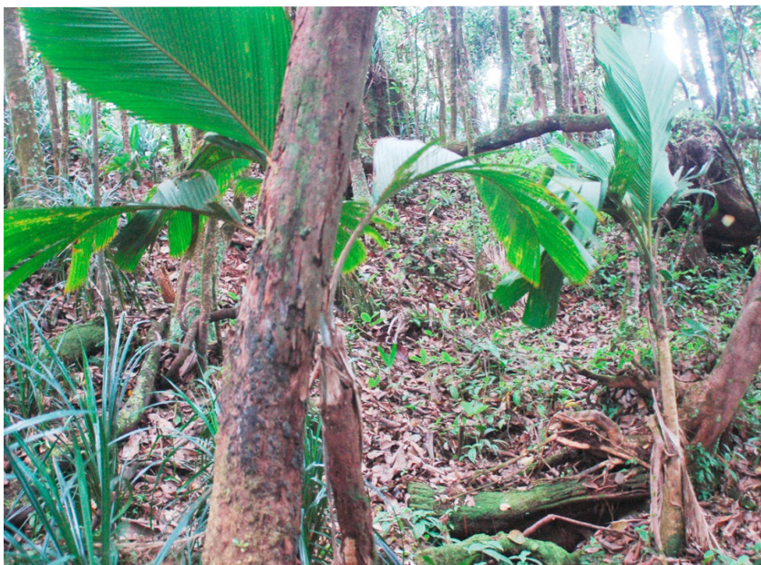
Cloud forest on Silhouette Island

Recent studies of climate change in Seychelles have revealed a pattern of slight increases in mean annual temperatures and significant