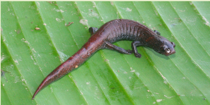
Bradytriton silus