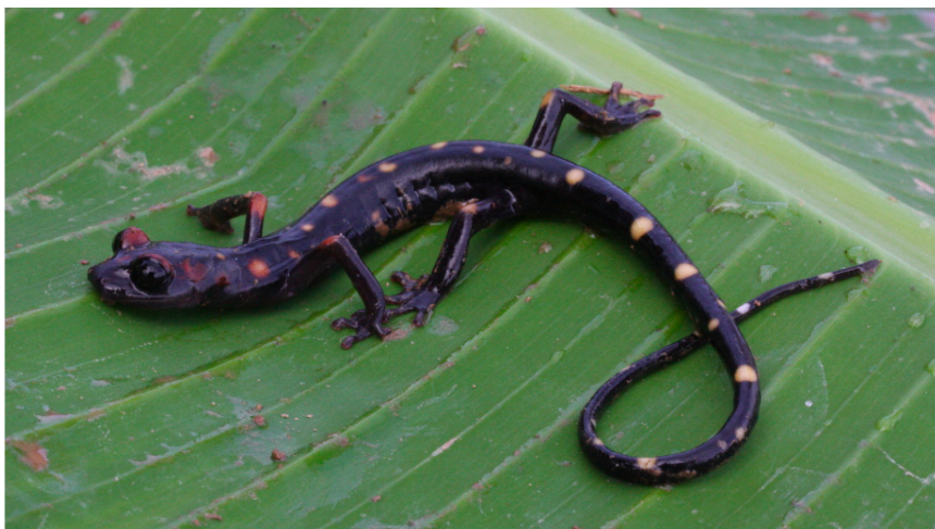
Nyctanolis pernix

Extinction, a worldwide consortium of 68 biodiversity conservation organizations, has designated Bradytriton silus as a trigger species for pinpointing and conserving epicenters of imminent extinctions, in this case, the Sierra de los Cuchumatanes. In 2008, the Critical Ecosystems Partnership Fund (CEPF) included it as one of 10 focal species of Critically Endangered Guatemalan amphibians. This funding enabled the Museo de Historia Natural (MUSHNAT) at the Universidad de San Carlos de Guatemala to join with the Guatemalan NGO, Fundación para el Ecodesarrollo y la Conservación (FUNDAECO), in conducting field surveys for these 10 species. A team of biologists from the MVZ and MUSHNAT conducted a vertebrate survey of the Cuchumatanes in January 2009 and we were rewarded with the discovery of a new population of Bradytriton , 32 years after the species was last seen. The salamanders were found in an