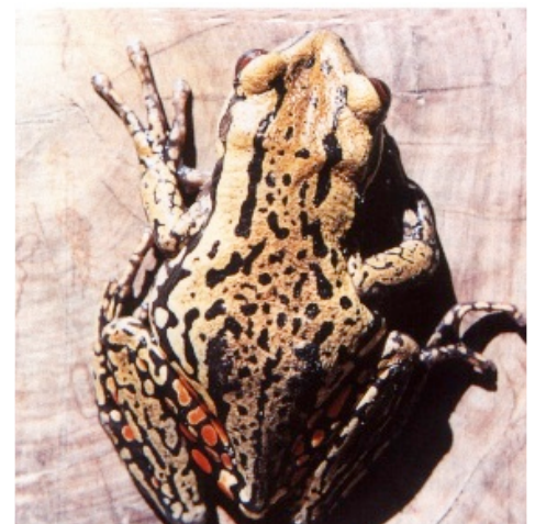
Fig 3. Argenteohyla siemersi pedersenii

Cabrera, A. L. 1976. Regiones Fitogeográficas Argentinas . Enciclopedia Ar-