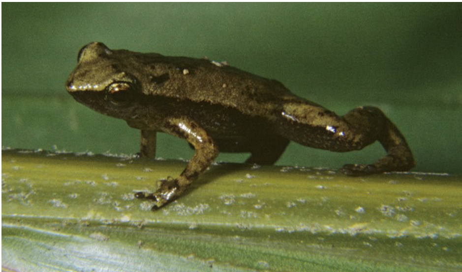
Sooglossus pipilodryas

the risks cannot be completely eliminated. With the very narrow ranges of these species, extinction is probable. Accordingly, the long-term survival of the Sooglossidae may require the establishment of assurance colonies. NPTS has maintained captive groups of S. gardineri , S. pipilodryas and S. sechellensis for several years, but has not succeeded in breeding them to date.