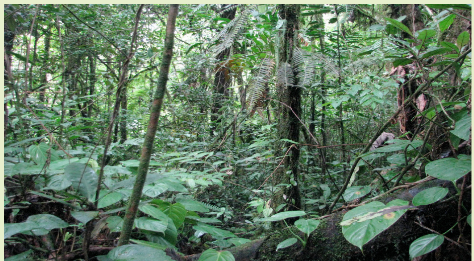
Maxbal Forest Habitat