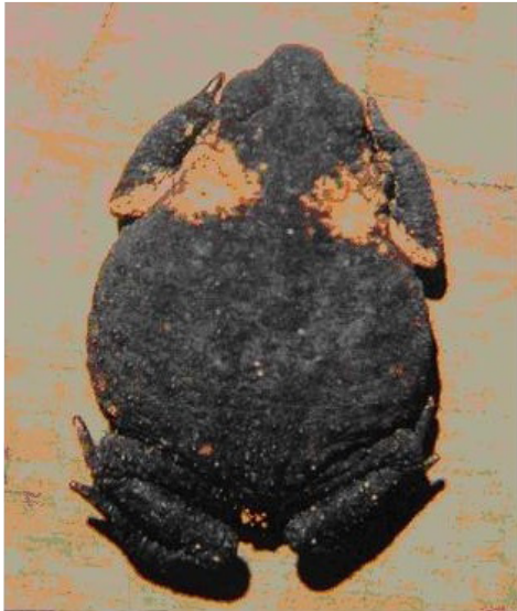
Fig 2. Melanophryniscus cupreuscapularis

the presence and absence of all species and emphasize the necessity to create new reserve areas that contain viable populations of amphibians not found in the current protected areas.