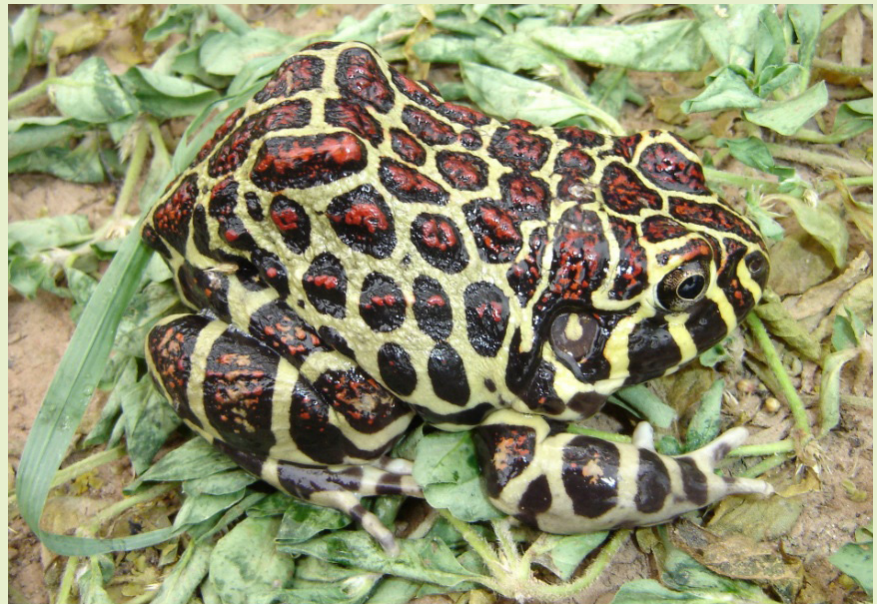
Fig 1. Leptodactylus laticeps

natural history and conservational status; Melanophryniscus cupreuscapularis (Fig. 2) is one of the many species considered Insufficiently Known by Lavilla et al. (2004) and is absent in the reserve areas of