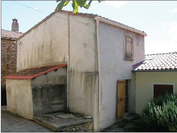
Grothendieck's house in Villecun, where he lived from 1973 to 1979.

Le Chambon. (The great story of Le Chambon has been the subject of many documentaries, novels, and movies. 3 ) In Le Chambon, Grothendieck was able to attend the Collège Cévénol, an international private school founded by Trocmé, which from the beginning was dedicated to nonviolence and the solidarity of all people—not popular ideas in a time of war. In 1945 Alexander completed there his rather chaotic schooling with the baccalauréat .