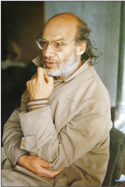
Grothendieck in May 1988.

Many people who know Grothendieck report that he has “always” been very interested in dreams. But they became the central theme of his thinking only after the “great turning point” of 1970. It appears that he thoroughly worked through, for example, Freud’s Traumdeutung ( The Interpretation of Dreams ) and also read other relevant literature. 9 On the other hand, he does not describe even a single one of his own dreams that had great importance for him, and he says nothing about how he analyzed them.