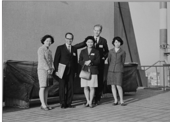
With Atiyah and three Japanese ladies in Japan, 1969.

At the time Hörmander was twenty-six, one year younger than I and already famous. Outside the circle of the participants in the Laurent Schwartz seminar at the Institut Henri Poincaré (a small circle indeed: Lions, Malgrange, Malliavin, Martineau, and a few others), nobody knew me—nobody, that is, except Hörmander. We had exchanged letters since 1956, and Schwartz had asked me to give a couple of lectures at the quarterly Bourbaki seminar on