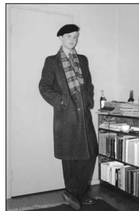
Student in Lund around 1950.

Lars became emeritus on January 1, 1996. From the beginning of the 1990s his research was not as focused on partial differential equations as it had been before. He looked back on his career and took up the study of various problems that he had dealt with and continued publishing interesting papers. Lars was always interested in the Nordic cooperation of mathematicians. He published his first paper in the proceedings of the Scandinavian Congress of Mathematicians held