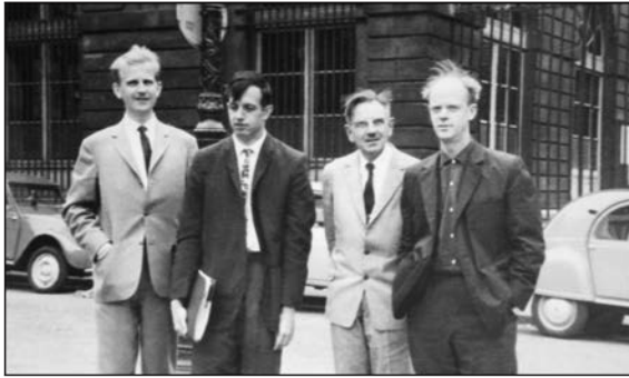
With John Forbes Nash, Jean Leray, and Lars Gårding in Paris, 1958.