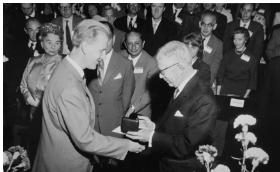
Receiving the Fields Medal from King Gustav VI Adolf.

In 1962, at the age of thirty-one, Hörmander was awarded the Fields Medal. His impressive work on PDE, in particular his characterization of