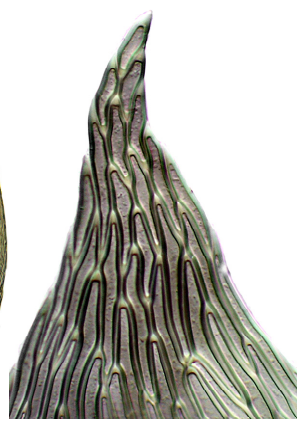
vegetative habit and shoot (dry), leaf outline, and leaf apex = 1 mm, = 0.1 mm, = 10 \mu m