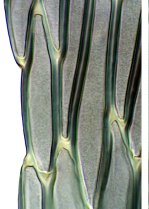
margin midleaf 10 μm