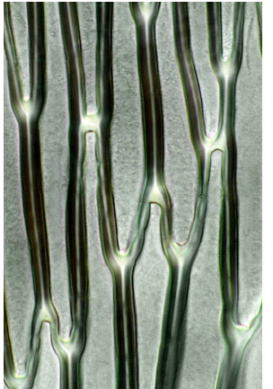
cells midleaf 10 µm