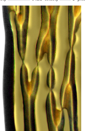
inflated alar cells 10 μm