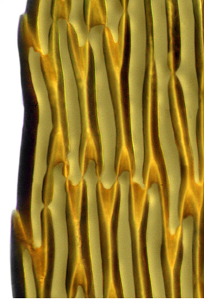
margin midleaf 5 μm, 5 μm