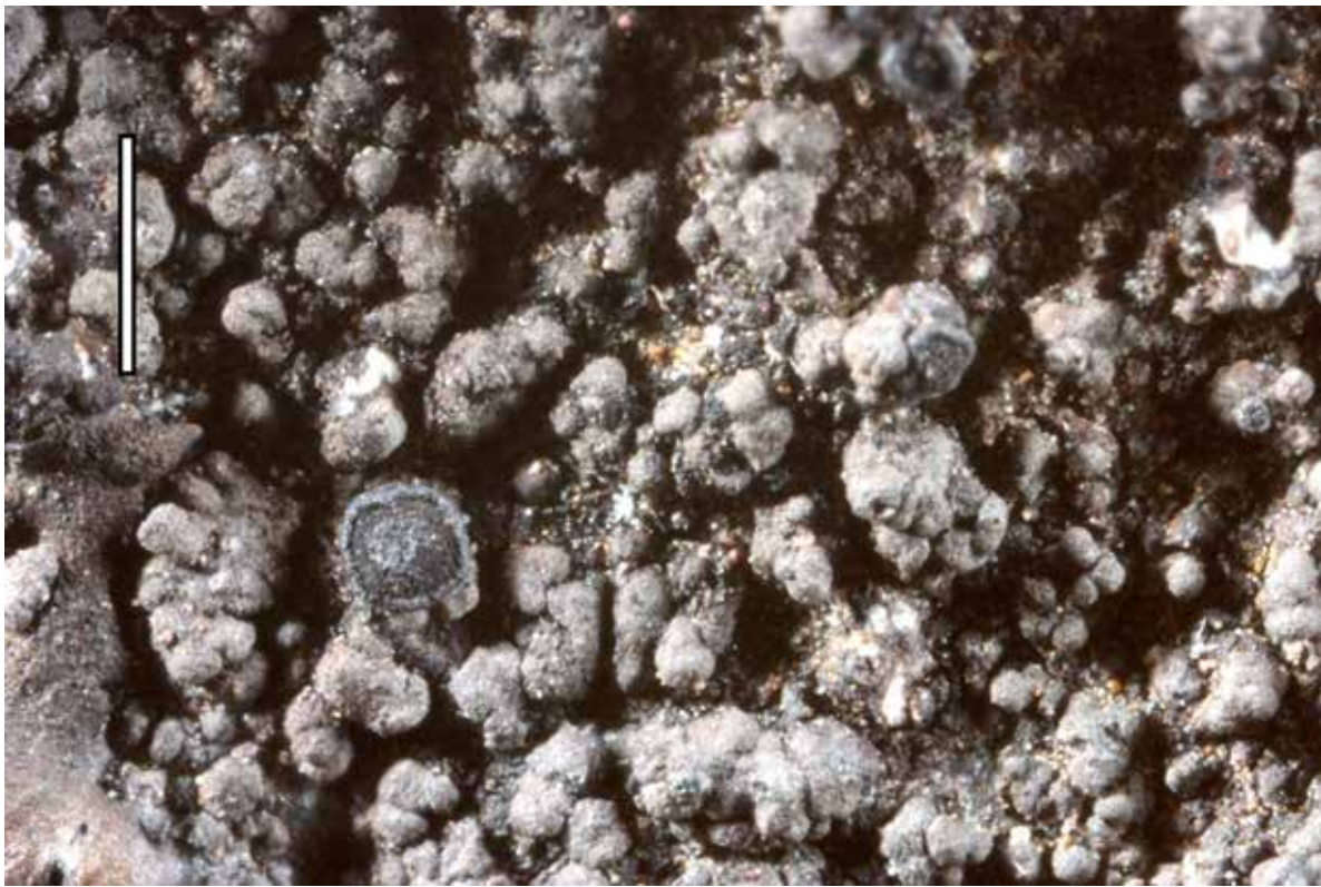
Fig. 2. Monerolechia glomerulans (Elix 41083in CANB). Scale: = 1 mm

Like other species of Monerolechia , M. glomerulans is closely associated with or initially parasitic on various Xanthoparmelia species. It is characterized by the olive-brown to olive-black, bullate to squamulose thalli, black lecideine apothecia, small, Buellia -type ascospores, 10–15 µm long, 5–8 µm wide, and bacilliform conidia, 4–6 µm long, 1–1.5 µm wide. However, the most characteristic feature of this species is the morphology of the thallus where the bullate areoles or convex squamules become clustered closely together and agglomerated to form weakly elevated, broccoli-like heads (or glomerules). With age these glomerules may become markedly elevated or stalked (to 3 mm high) and isidia-like. Since more specimens of this rare species are now available an amended description follows.