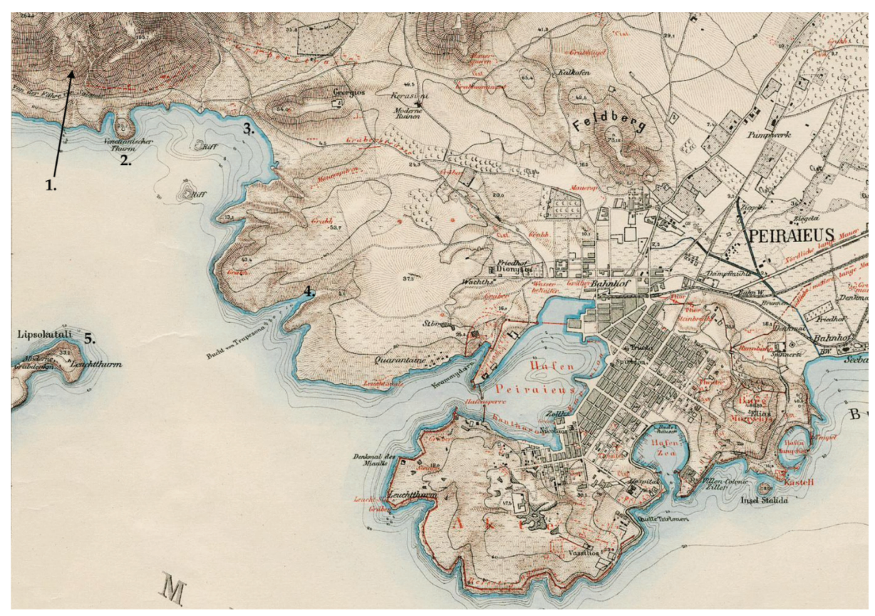
Map I: Karten von Attika Bl. III. (1) foothills of Mt. Aigaleo; (2) the 'Venetianischer Thurm'; (3) Keratsini; (4) Trapezona; (5) Leipsokoutala, ancient Psyttaleia. Modern Perama lies beyond the boundaries of this map, extending to the left of (1) and (2).

The exact location now lies under the heavy industrial development of this stretch of coastline, but a good candidate for Dodwell's K\lambda\epsilon\varphi\thetao-\pi\nu\rho\gamma\circ\varsigma ( sic. ) is marked on Curtius' and Kaupert's Karten von Attika as the 'Venetianischer Thurm' ('Venetian Tower', Karten von Attika Bl. III). Another nineteenth-century traveller, W. M. Leake, wrote that the eastern entrance to the strait of Salamis was demarcated by the western cape of Port Phōrōn on the mainland and the cape of Agia Varvara on Salamis (the easternmost extremity of the island, close to Psyttaleia).<sup>13</sup> Leake placed Phōrōn Limēn at Keratsini, the bay to the east of this tower, and not at the bay of Trapezona (mod. Drapetsona), which he thought was too close to Piraeus.<sup>14</sup> Curtius and Kaupert were inclined to agree with him.<sup>15</sup>