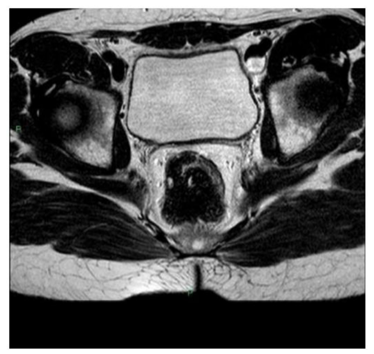
No images compatible with undescended testicles are evident. Figure 2: Axial T2- weighted image of the pelvic district