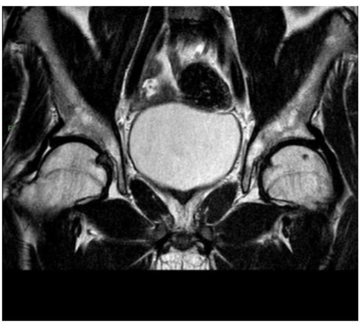
Prostate gland and seminal vesicles are not evident. Figure 3: Coronal T2 weighted image of pelvic district

The laboratory tests and the diagnostic investigations to which the patient has been subjected have led us to formulate the diagnostic suspicion of a condition falling within the spectrum of sexual disorders and in this case bilateral congenital anorchia.