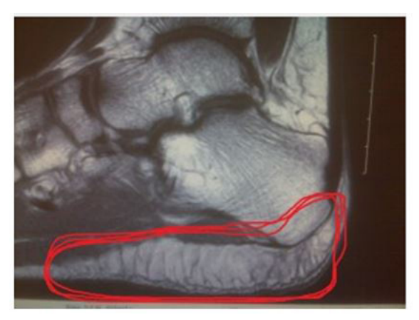
Figure 3: Saggital MRI shows thinned out heel fat pad. Note that there is no signal in the plantar fascia or plantar muscles. Heel pad fat is relatively less in thickness and heel pad fat measures 1.3cm

Heel pain may arise from the fat pad itself. For example, rupture of the fibrous tissue septa, which occurs mainly in obese elderly patients under the influence of ordinary weight-bearing or owing to loss of fat pad results in attrition of the fat pad with poor stress absorption [10]. A painful heel fat pad is often confused with plantar fasciitis. MR imaging can also help distinguish between these two conditions and in some cases of painful heel fat pad can demonstrate changes in signal intensity, with low-signal-intensity bands representing fibrosis and decreased height of the fat pad (Figure 3).