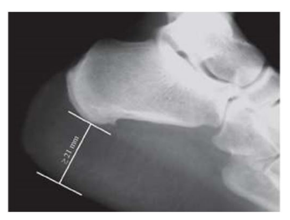
Figure 1: The heel fat pad index

MR imaging characteristics of plantar fasciitis include (a) fascial thickening that is often fusiform and typically involves the proximal portion and extends to the calcaneal insertion and (b) increased signal intensity of the proximal plantar fascia (Figure 2). Other MR imaging findings that indicate plantar fasciitis includes edema of the adjacent fat pad and underlying soft tissues [9].